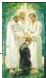
Right middle finger