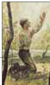
Left index finger