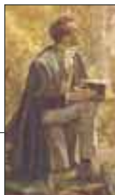
Left little finger