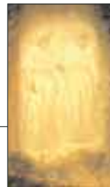
Left middle finger