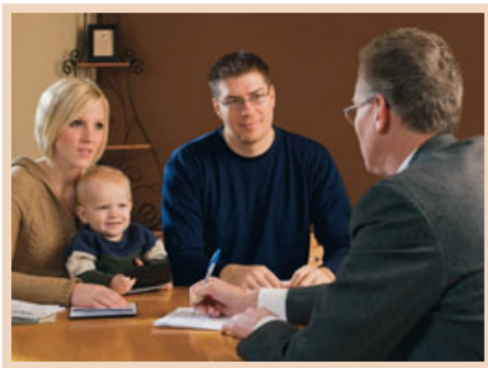
The bishop meets with members in need and reviews how best to render assistance and help them help themselves.

Bishops are blessed with the gift of discernment to understand how best to help those in need. Each individual circumstance is different and requires inspiration. Guided by the Spirit and the basic