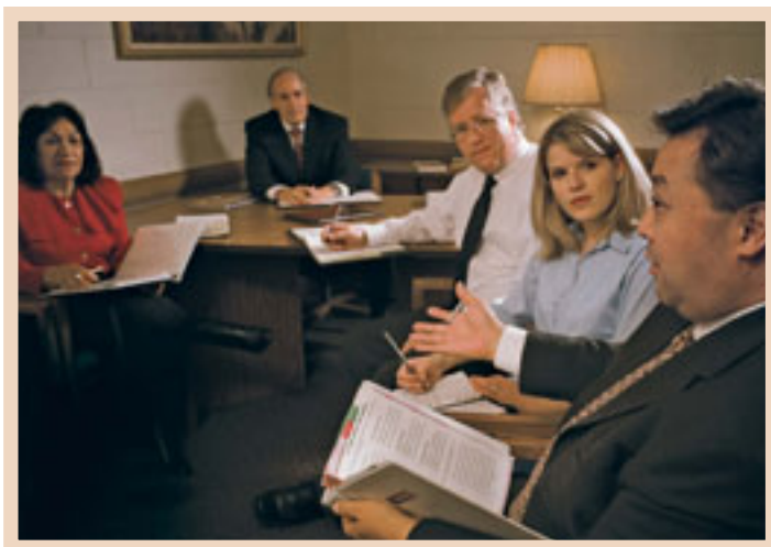
Under the bishop's direction, the ward council helps resolve welfare needs.

by home teachers, visiting teachers, and others who have special skills.