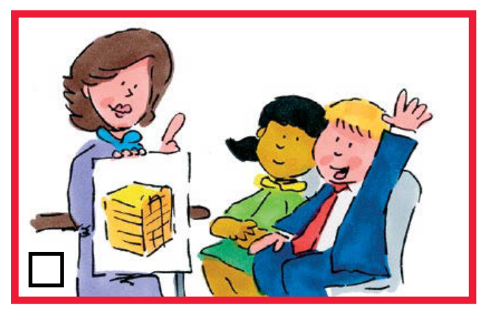
I will show respect at church by