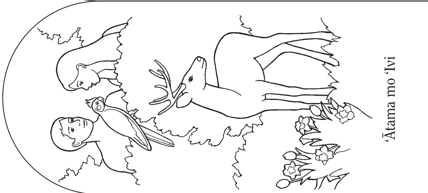
‘Ātama mo ‘Ivi