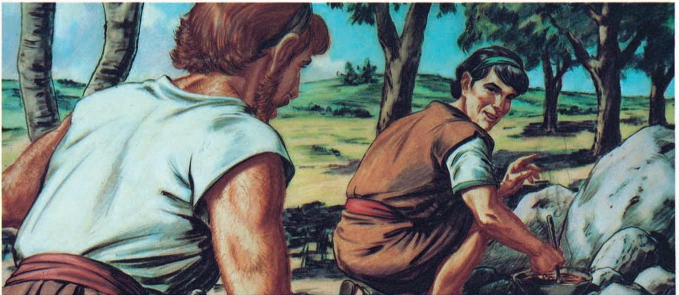
Esau asked Jacob for some pottage. Jacob said he could have some. But Esau must give him