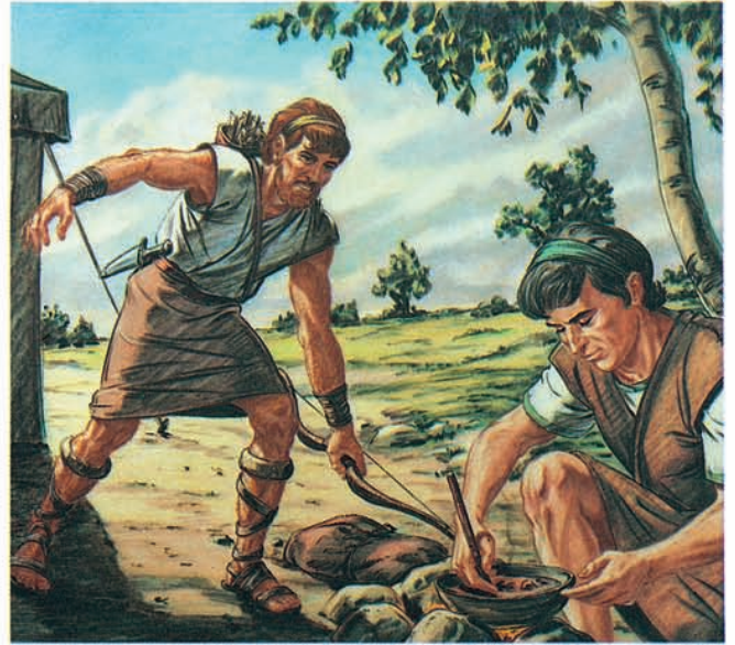
One day Esau came home very hungry. Jacob had made some pottage. (Pottage is like soup.)