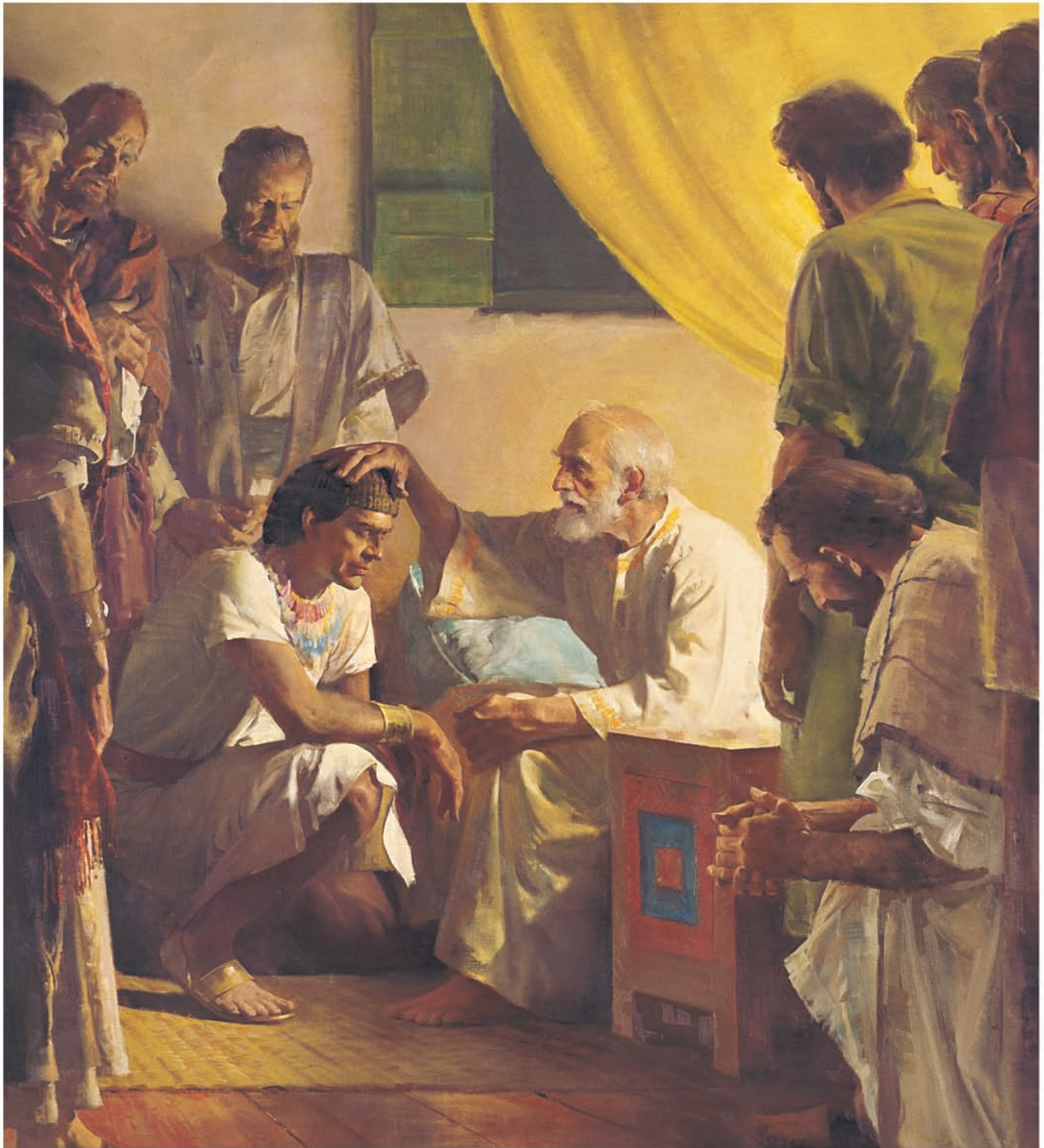
Before Jacob died, he blessed all of his sons.