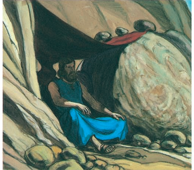
One of the 70 elders on Mount Sinai was Joshua. He waited there for Moses. Aaron and the other men went down the mountain.