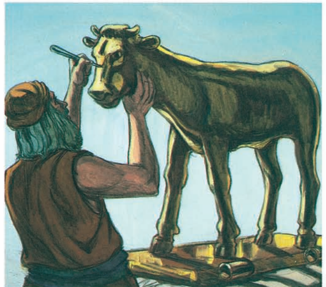
All the men and women wore gold earrings. Aaron told them to bring the earrings to him. He made an idol out of the gold. The idol looked like a calf.