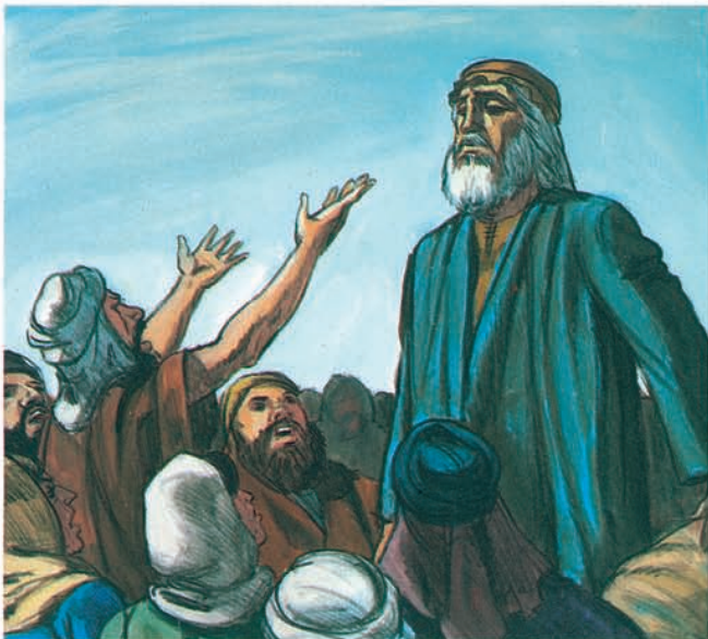
Some of the Israelites came to Aaron. They said Moses had been gone a long time. They did not know what he was doing. They were tired of waiting for him. They wanted Aaron to make an idol for them to worship. They did not want to worship God.