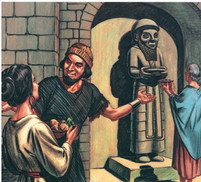
Solomon had many wives. Some of his wives did not believe in God. They worshiped idols.