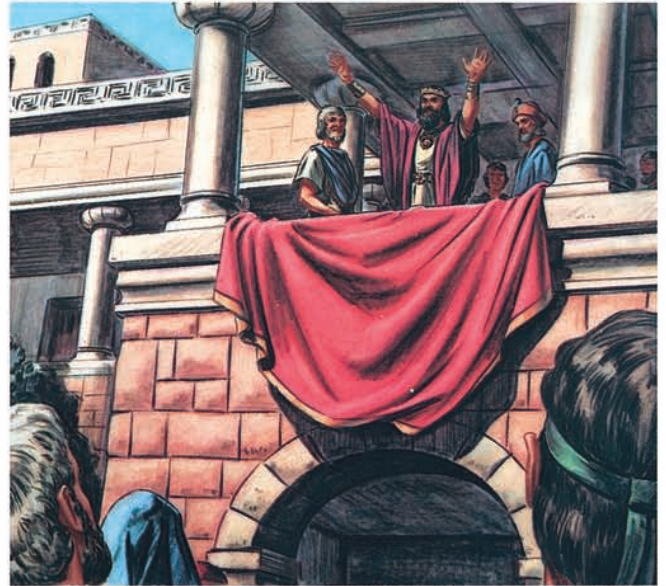
Solomon was the king of Israel for a long time. He obeyed God for many years. 1 Kings 11:41-42