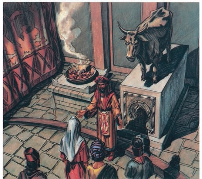
When Solomon was old, he forgot God. His wives wanted him to worship their idols. Solomon did the wrong thing. He made sacrifices to the idols. God was angry at him.