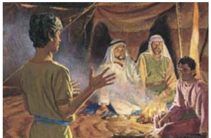
The Lord promised Nephi that he would be blessed because of his faith. He would become a leader over his brothers. 1 Nephi 2:19–22