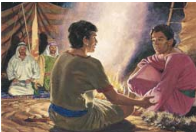
Nephi told his brothers what Jesus had told him. Sam believed Nephi, but Laman and Lemuel would not believe. 1 Nephi 2:17–18