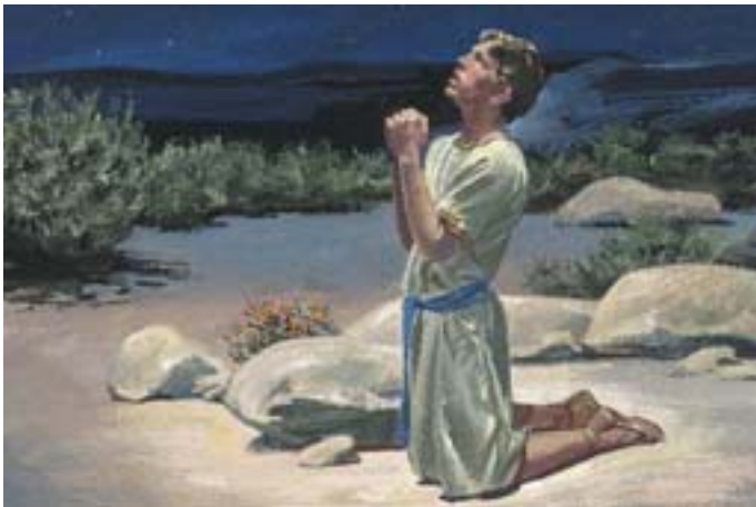
Nephi wanted to understand the things Lehi had seen. He prayed to know if his father had done the right thing by leaving Jerusalem. 1 Nephi 2:16