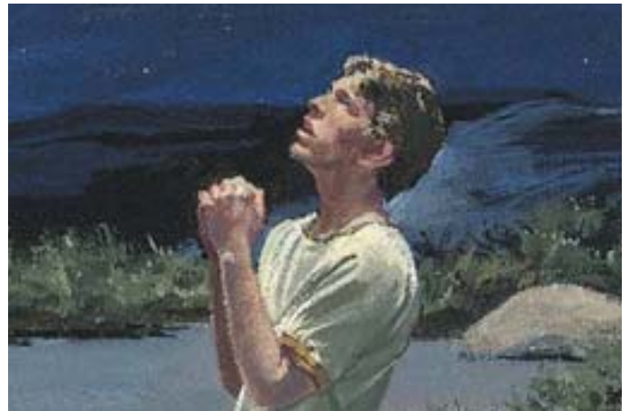
Jesus Christ visited Nephi and told him that Lehi's words were true. Nephi believed and did not rebel as Laman and Lemuel did. 1 Nephi 2:16