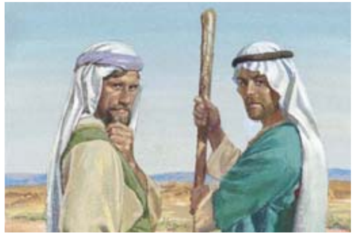
Laman and Lemuel thought their father was foolish for leaving Jerusalem and their riches. They did not believe that Jerusalem would be destroyed. 1 Nephi 2:11, 13