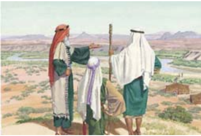
Lehi named the river Laman and the valley Lemuel. Lehi wanted his sons to be like the river and valley, continually flowing to God and steadfastly keeping the commandments. 1 Nephi 2:8–10, 14