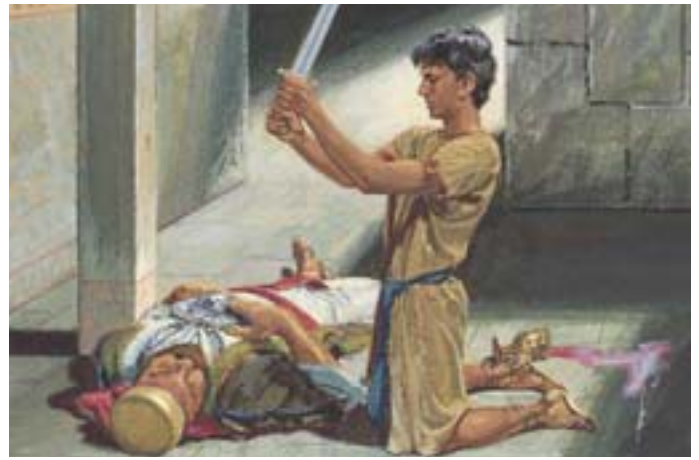
The Holy Ghost again told Nephi to kill Laban so Nephi could get the brass plates. Lehi's family needed the plates so they could learn the gospel. 1 Nephi 4:12, 16-17