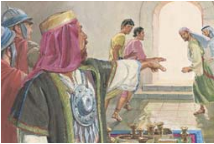
Laban told his men to kill Lehi's sons. Nephi and his brothers ran and hid in a cave. Laban kept their gold and silver. 1 Nephi 3:25-27