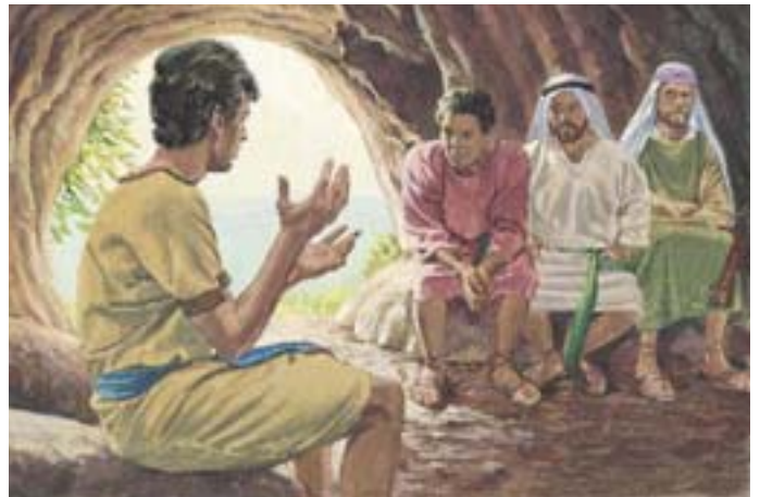
Nephi told his brothers to have faith in the Lord and not be afraid of Laban and his men. Nephi encouraged his brothers to go back to Jerusalem. 1 Nephi 4:1-4