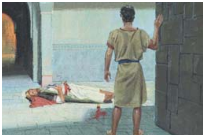
As Nephi got close to Laban's house, he saw a drunk man lying on the ground. It was Laban. 1 Nephi 4:6-8