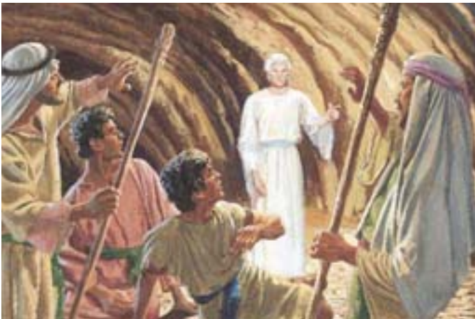
An angel appeared and told Laman and Lemuel to stop. He said the Lord would help them get the plates. He also said Nephi would become a leader over his brothers. 1 Nephi 3:29