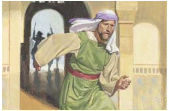
Laban was angry and would not give Laman the brass plates. Laban wanted to kill Laman, but Laman escaped. 1 Nephi 3:13–14