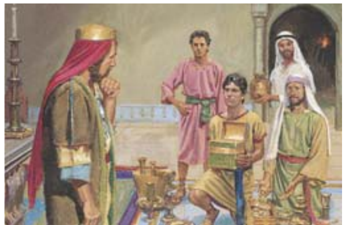
They showed Laban their riches and offered to trade them for the plates. When Laban saw their gold and silver, he wanted it for himself and threw them out. 1 Nephi 3:24–25