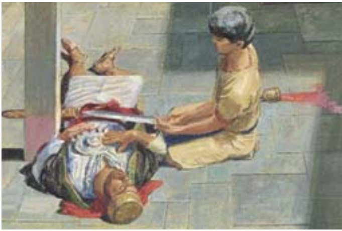
Nephi saw Laban's sword and picked it up. The Holy Ghost told Nephi to kill Laban, but Nephi did not want to kill him. 1 Nephi 4:9-10