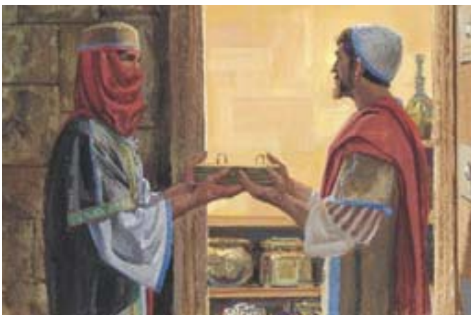
He told Zoram to get the brass plates. Zoram thought Nephi was Laban, so he gave him the plates. Nephi told Zoram to follow him. 1 Nephi 4:21, 24-25