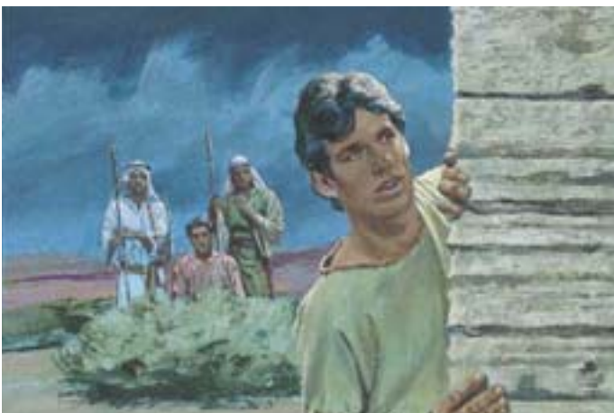
That night Nephi's brothers hid outside the city wall while Nephi sneaked inside. He walked toward Laban's house. 1 Nephi 4:5