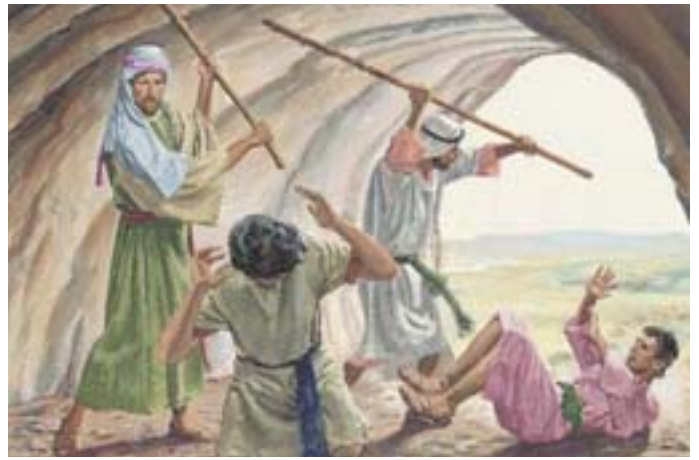
Laman and Lemuel were angry with Nephi. They beat Nephi and Sam with a stick. 1 Nephi 3:28