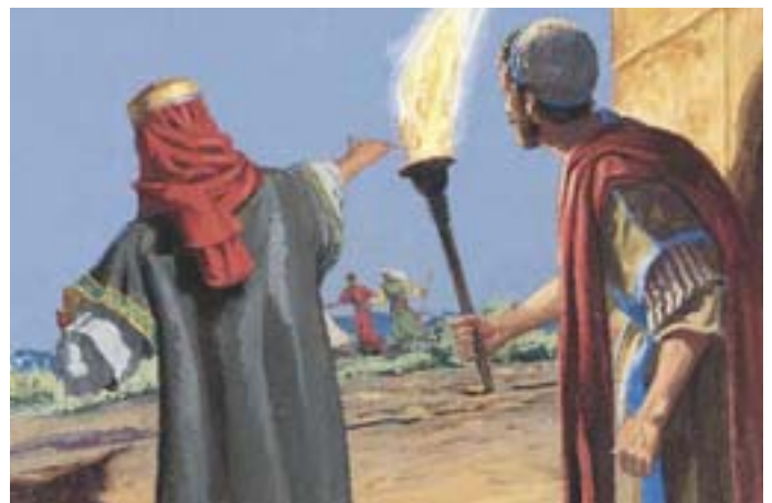
Laman, Lemuel, and Sam saw Nephi coming and were scared; they thought he was Laban. They started to run away but stopped when Nephi called to them. 1 Nephi 4:28-29