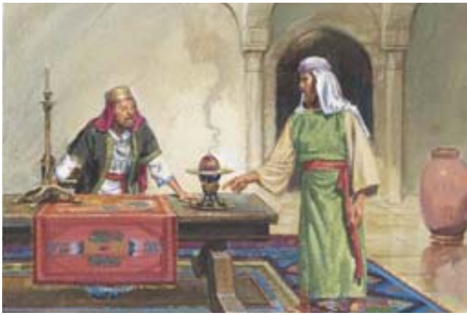
Laman went to Laban and asked him for the plates. 1 Nephi 3:11–12