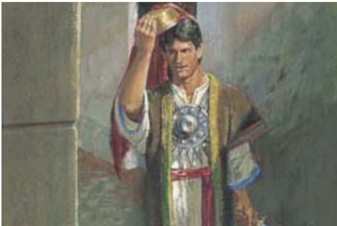
Nephi obeyed the Holy Ghost and killed Laban. Nephi then put on Laban's clothes and armor. 1 Nephi 4:18-19