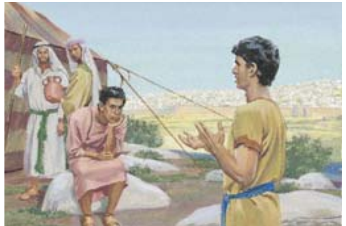
Nephi said they could not return without the brass plates. He told his brothers to have more faith in the Lord and they would be able to get the brass plates. 1 Nephi 3:15–16