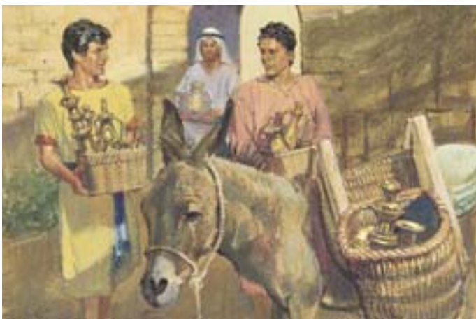
Nephi and his brothers went to their old home in Jerusalem and gathered their gold and silver to exchange for the plates. 1 Nephi 3:22