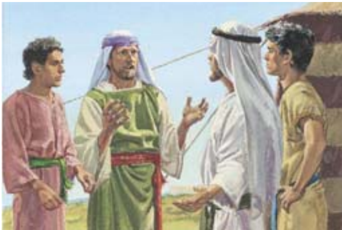
Laman told his brothers what had happened. He was afraid and wanted to give up and go back to their father in the wilderness. 1 Nephi 3:14