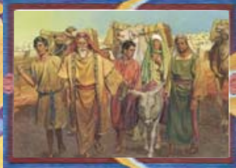
1 Lehi's family leaves Jerusalem.