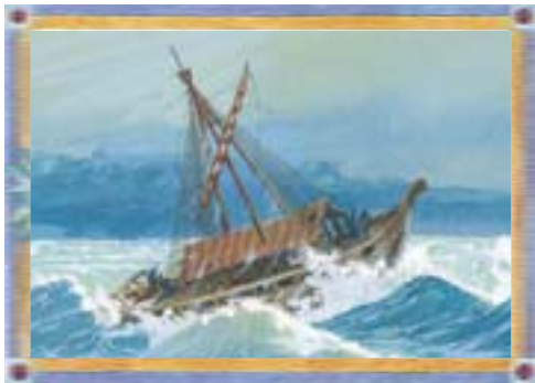
3 Lehi's family travels on the sea.