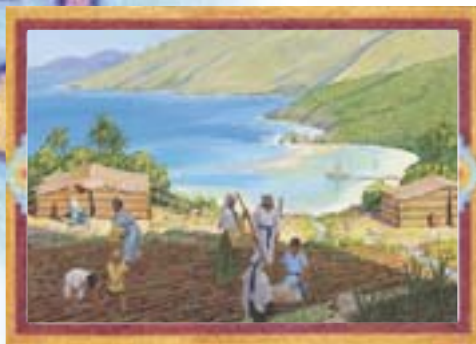
4 Lehi's family arrives in America.