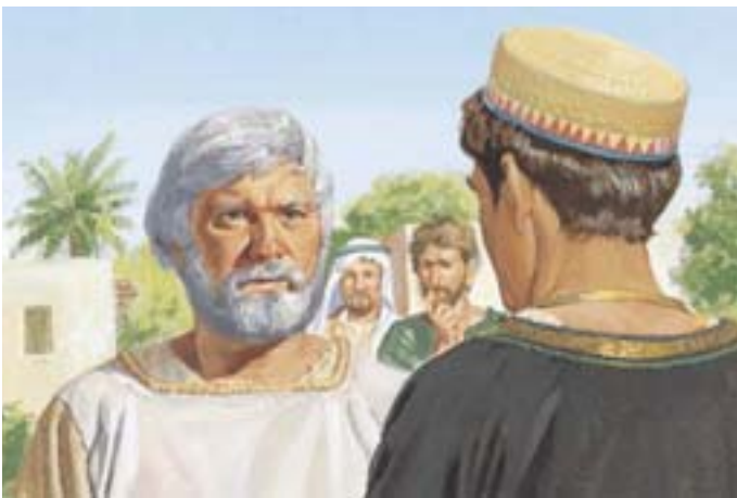
Jacob's faith in Jesus Christ could not be shaken. He had seen angels and had heard the Lord's voice. He knew Jesus would come. Jacob 7:5