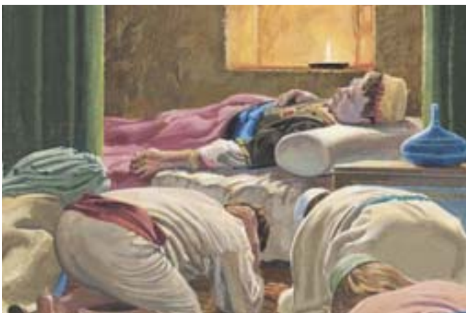
After Sherem finished talking to the people, he died. The people felt God's power, and they fell to the ground. Jacob 7:20-21