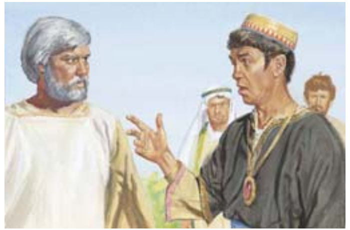
Jacob taught the people to believe in Christ. Sherem wanted to argue with Jacob and persuade him that there would be no Christ. Jacob 7:6