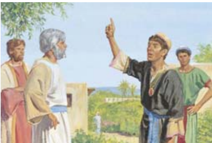
Sherem asked to see a sign. He wanted Jacob to prove there is a God. He wanted to see a miracle. Jacob 7:13