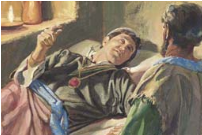
Sherem was weak and knew he was going to die. He called the people together. Jacob 7:16