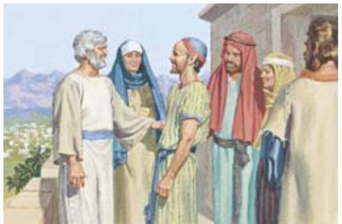
The people began to repent and read the scriptures. They lived in peace and love. Jacob was happy and knew that God had answered his prayers. Jacob 7:22-23