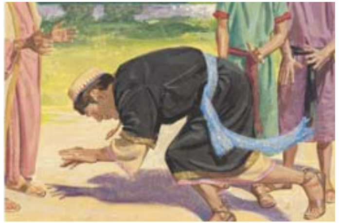
Sherem immediately fell down. He could not get up for many days. Jacob 7:15