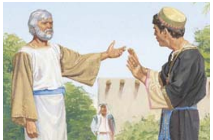
The Holy Ghost was with Jacob as he bore his testimony of Jesus Christ to Sherem. Jacob 7:8-12