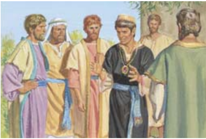
Sherem told the people that there would be no Christ. Many people believed Sherem. Jacob 7:2-3