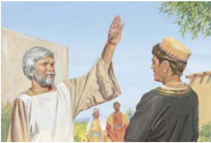
Jacob said if God struck Sherem, that would be a sign of God's power. Jacob 7:14