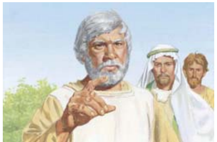
Jacob would not ask God for a sign. He said Sherem already knew that what Jacob had taught was true. Jacob 7:14