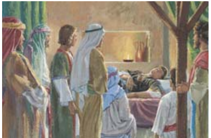
He told them he had lied. He said they should believe in Jesus Christ. Jacob 7:17-19