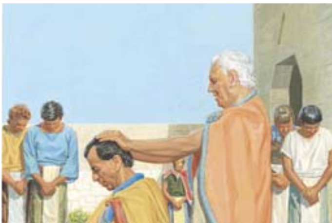
King Benjamin gave his son Mosiah the right to be the new king. Three years later King Benjamin died. Mosiah 6:3, 5