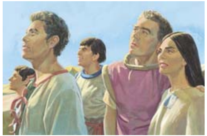
He warned the people to be careful with what they thought, said, and did. They were to be faithful and keep the commandments for the rest of their lives. Mosiah 4:30