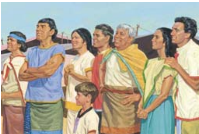
The Holy Ghost filled their hearts. They knew that God had forgiven them and that he loved them. They felt peace and joy. Mosiah 4:3