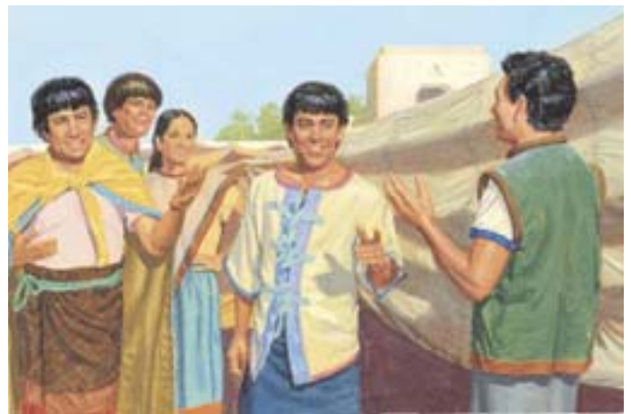
They all covenanted, or promised, to keep God's commandments. King Benjamin was pleased. Mosiah 5:5-6