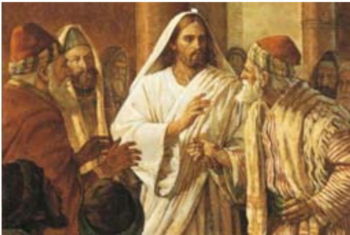
Jesus would perform miracles. He would heal the sick and bring the dead back to life. He would make the blind see and the deaf hear. Mosiah 3:5