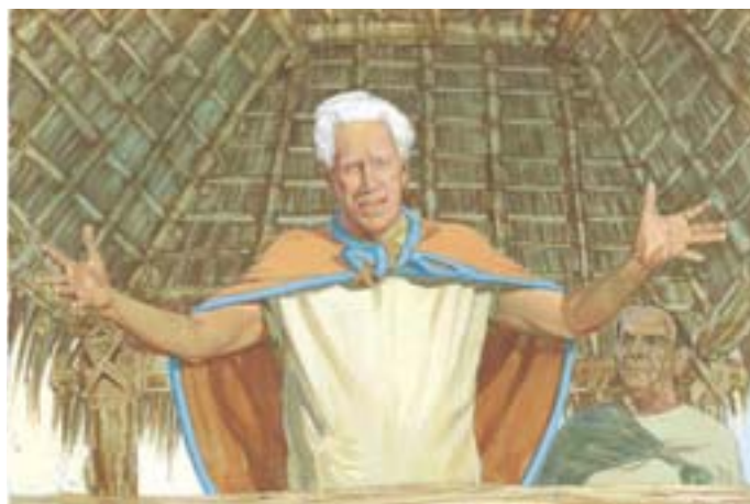
King Benjamin told his people to believe in God. He wanted them to know that God had created all things and that he is wise and powerful. Mosiah 4:9