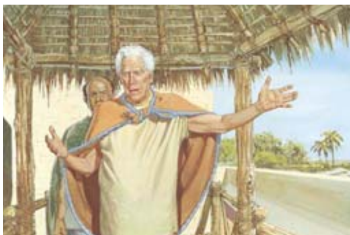
He told the parents not to let their children fight or argue. Mosiah 4:14