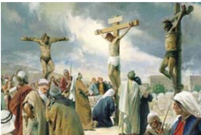
King Benjamin told the Nephites that wicked men would whip Jesus. Then they would crucify him. Mosiah 3:9