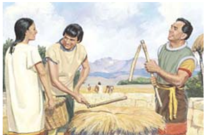
Mosiah was a righteous king. He worked hard and served his people, as his father had. Mosiah 6:6-7