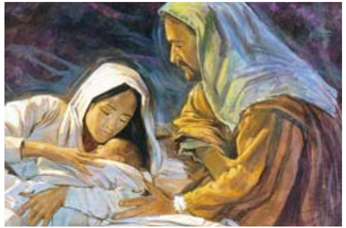
King Benjamin said Jesus Christ would soon be born on the earth. His mother’s name would be Mary. Mosiah 3:5, 8