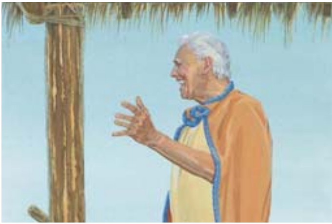
King Benjamin told the people to obey God’s commandments. Those who faithfully keep the commandments will be happy and someday live with God. Mosiah 2:41