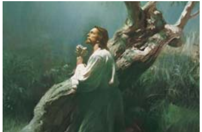
Jesus would suffer and die for the sins of all people. Those who repent and have faith in Jesus will be forgiven of their sins. Mosiah 3:7, 11–12