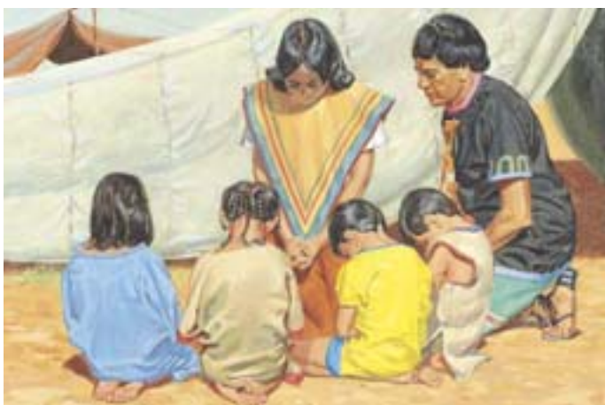
King Benjamin told the people to be humble and pray every day. He wanted his people to always remember God and be faithful. Mosiah 4:10-11