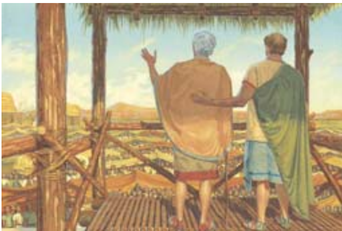
King Benjamin asked the people if they believed his teachings. They all said they did. The Holy Ghost had changed them, and they no longer wanted to sin. Mosiah 5:1-2