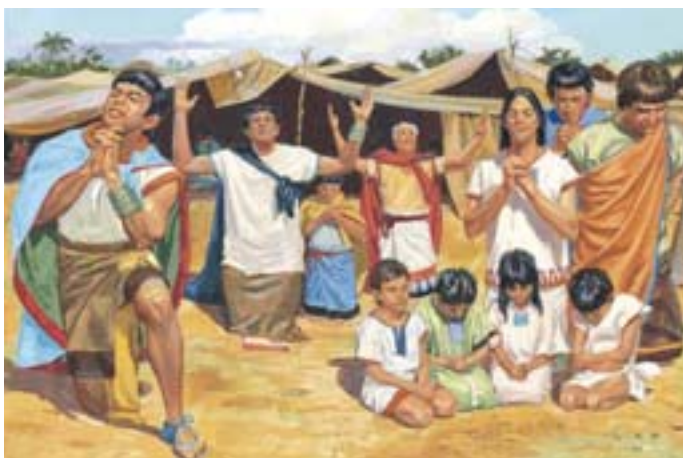
After King Benjamin spoke, the Nephites fell to the ground. They were sorry for their sins and wanted to repent. Mosiah 4:1-2