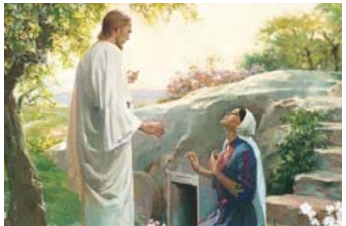
After three days Jesus would be resurrected. Mosiah 3:10