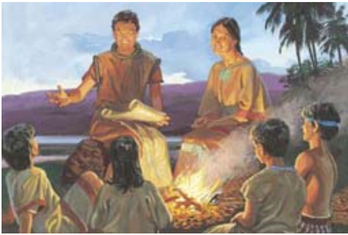
He told them to teach their children to be obedient and to love and serve one another. Mosiah 4:15