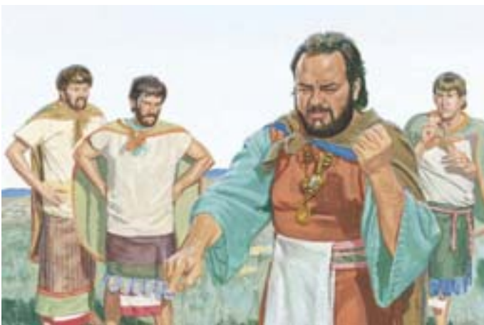
King Noah did not want the men to return to their families. He ordered them to stay with him. Mosiah 19:20