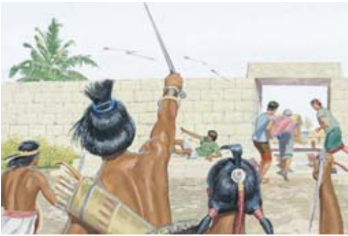
Some of the Nephites opposed King Noah and tried to kill him. The Lamanite army also came to fight the king and his followers. Mosiah 19:2-7