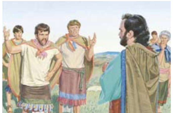
Most of the men who had run away with King Noah were sorry. They wanted to go back and help their wives and children and their people. Mosiah 19:19