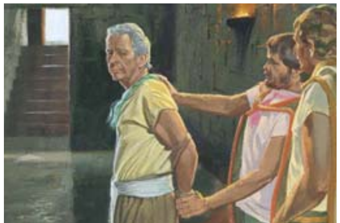
King Noah and all but one of his priests refused to believe Abinadi. Noah told the priests to kill Abinadi. They tied him up and threw him in prison. Mosiah 17:1, 5