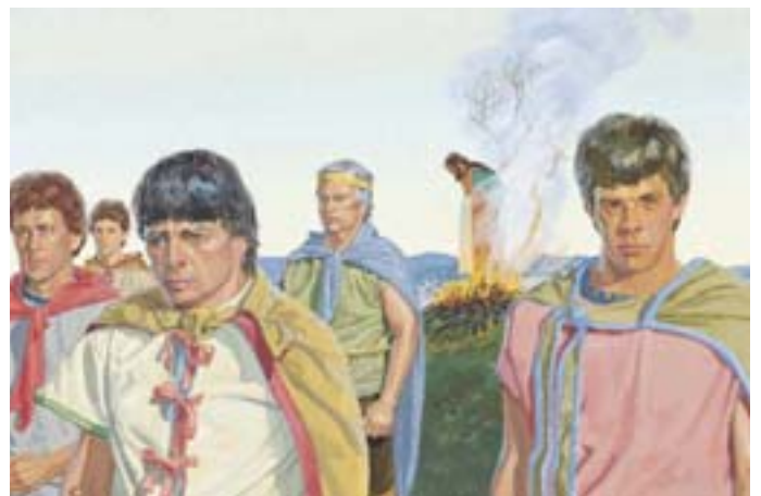
The men were angry with King Noah. They burned him to death, as Abinadi had prophesied. Then they went back to their families. Mosiah 19:20, 24