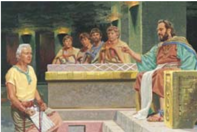
After spending three days in prison, Abinadi was again brought before King Noah. The king told Abinadi to take back what he had said against him and his people. Mosiah 17:6, 8