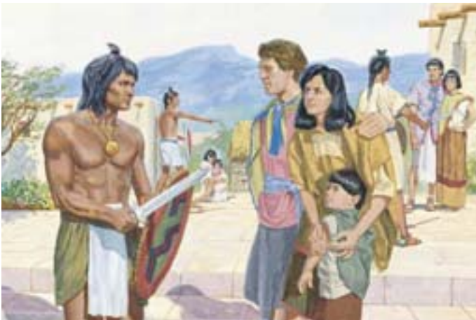
Many of the men would not leave. They were captured by the Lamanites. Mosiah 19:12, 15