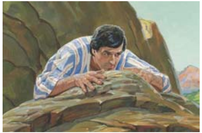
The king was angry with Alma and had him thrown out. Then he sent his servants to kill him. Alma ran and hid, and the servants never found him. Mosiah 17:3-4