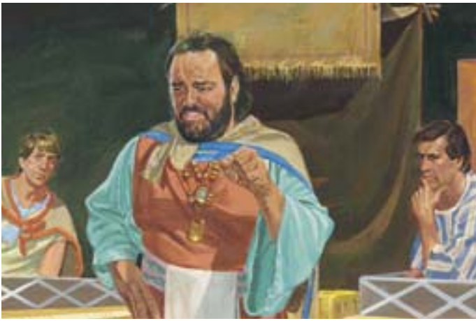
King Noah was angry and ordered his priests to kill Abinadi. Abinadi said if they touched him, God would kill them. Mosiah 13:1-3