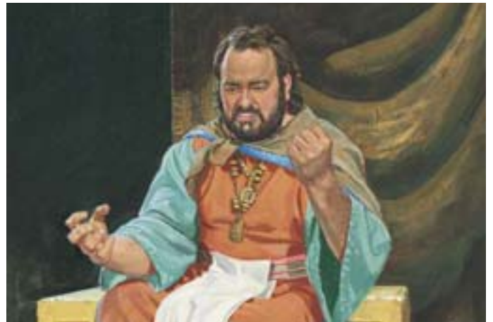
King Noah told Abinadi that if he did not deny all he had said, he would be killed. Mosiah 17:8