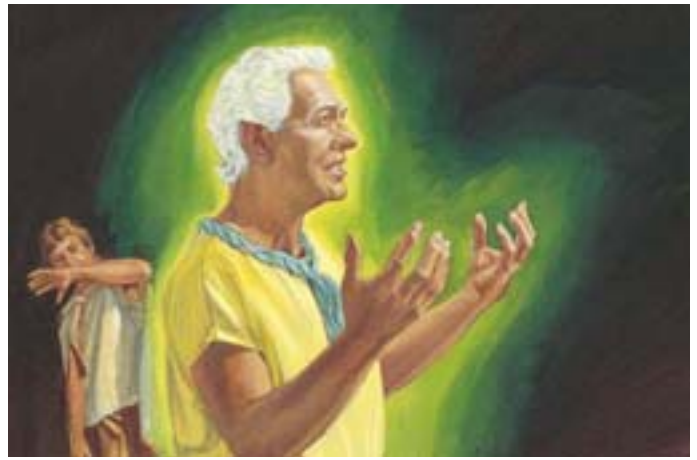
The Holy Ghost protected Abinadi so he could finish saying what the Lord wanted him to. Abinadi's face was shining. The priests were afraid to touch him. Mosiah 13:3, 5