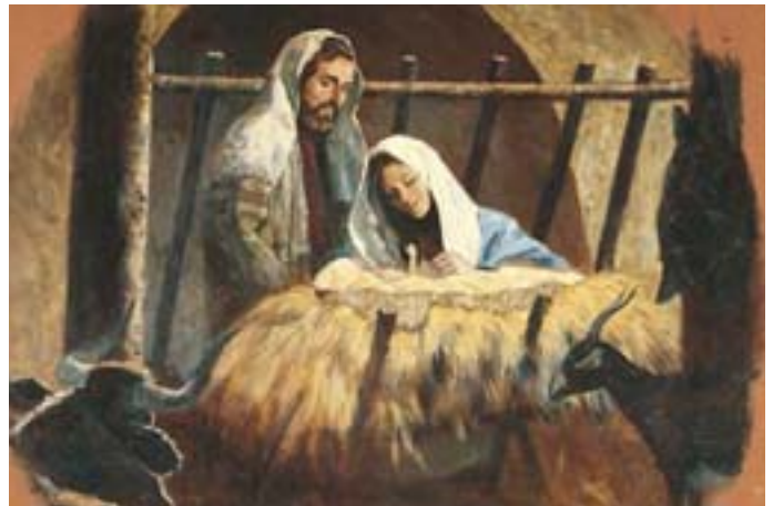
He told them Jesus Christ would be born on the earth. Jesus would make it possible for people to repent, be resurrected, and live with God. Mosiah 13:33-35; 15:21-23