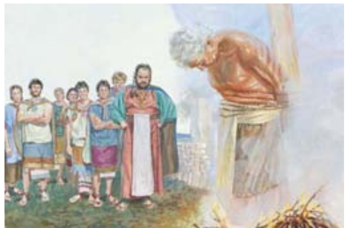
King Noah ordered his priests to kill Abinadi. They tied him up, whipped him, and burned him to death. Before he died, Abinadi said King Noah would also die by fire. Mosiah 17:13-15