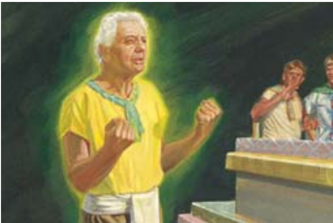
Speaking with power from God, Abinadi told the people about their wickedness. He read God's commandments to them. Mosiah 13:6-7, 11-24