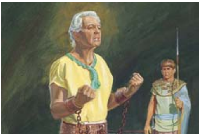
Abinadi knew he had spoken the truth. He was willing to die rather than take back what God had sent him to say. Mosiah 17:9-10