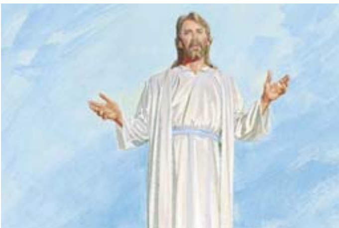
Abinadi told the people to repent and believe in Jesus Christ or they would not be saved. Mosiah 16:13