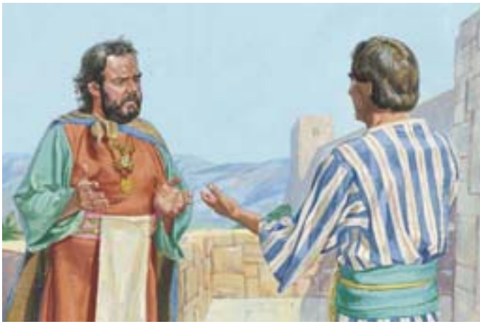
The one priest who believed Abinadi was named Alma. He asked King Noah to let Abinadi go. Mosiah 17:2