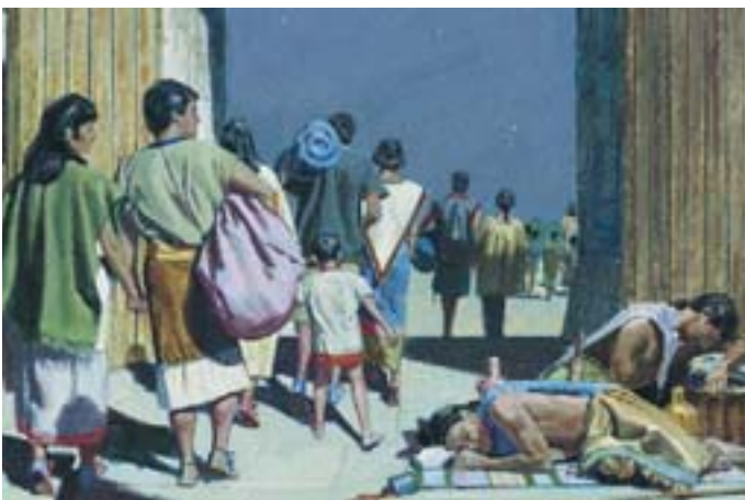
King Limhi and his people were able to walk past the drunken guards and escape. Mosiah 22:11