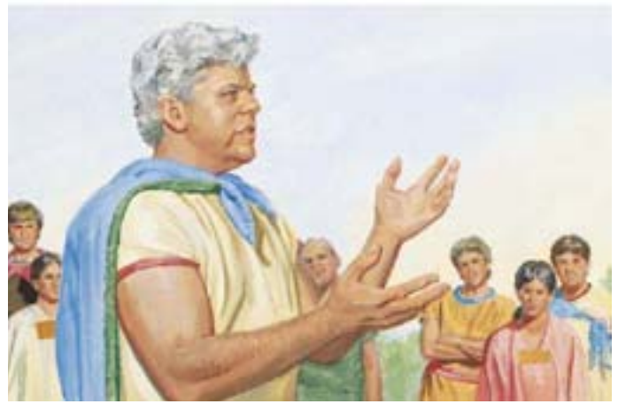
He told his people to repent, trust God, and obey the commandments. Then God would help them escape. Mosiah 7:19, 33