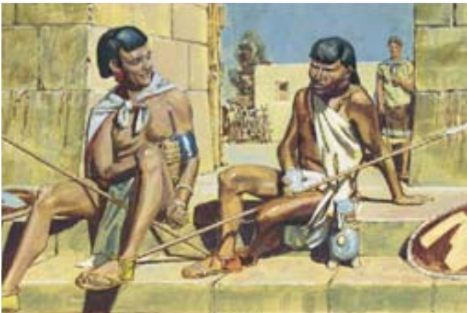
The Nephites learned that the Lamanites who guarded the city usually got drunk at night. Mosiah 22:6