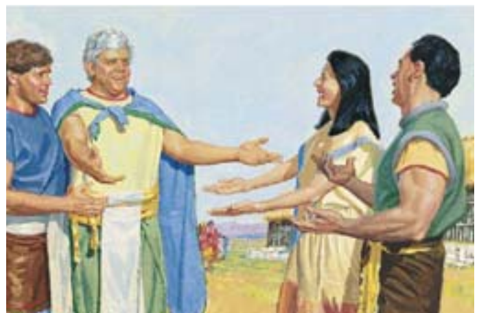
Ammon guided King Limhi and his people through the wilderness to Zarahemla, where they were welcomed. Mosiah 22:13-14