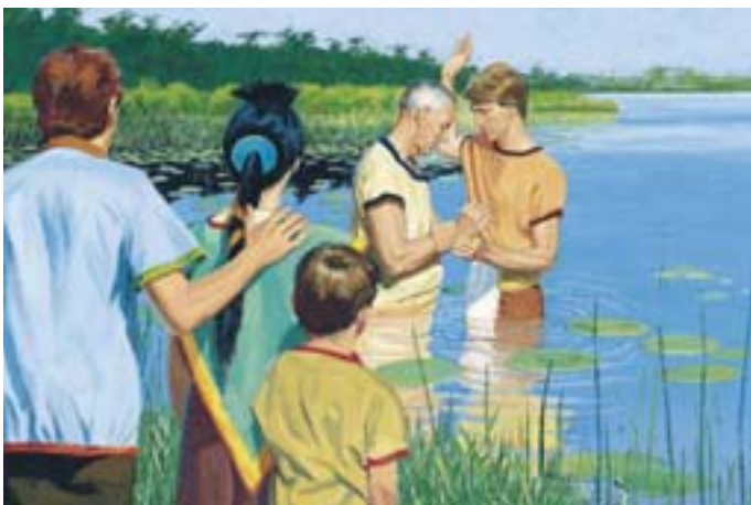
Zeezrom was baptized and began to preach the gospel. Many others were also baptized. Alma 15:12, 14