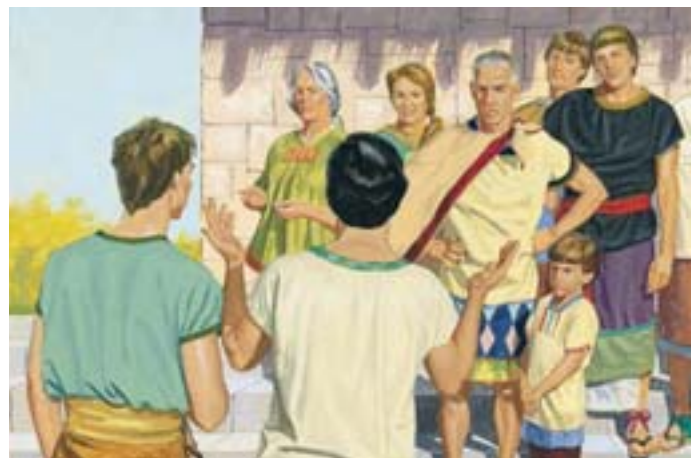
Amulek said Alma was a prophet of God and spoke the truth. The people were surprised to hear Amulek's testimony. Alma 10:9-10, 12