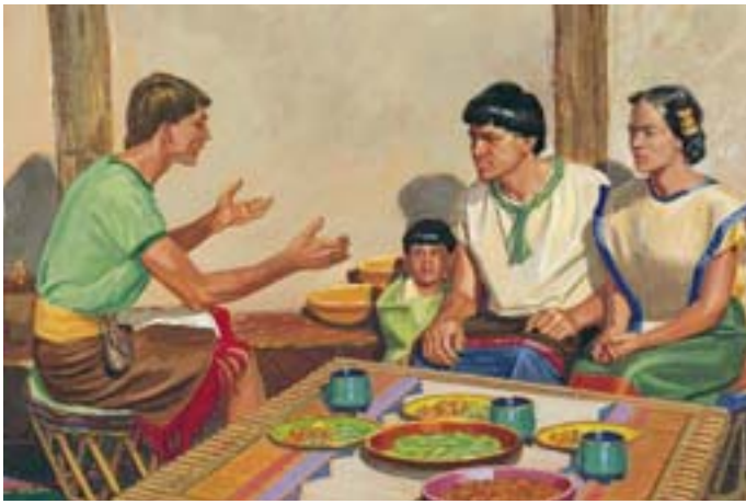
This man, Amulek, took Alma to his home and fed him. Alma stayed with Amulek and his family for many days. He thanked God for Amulek's family and blessed them. Alma 8:21-22, 27