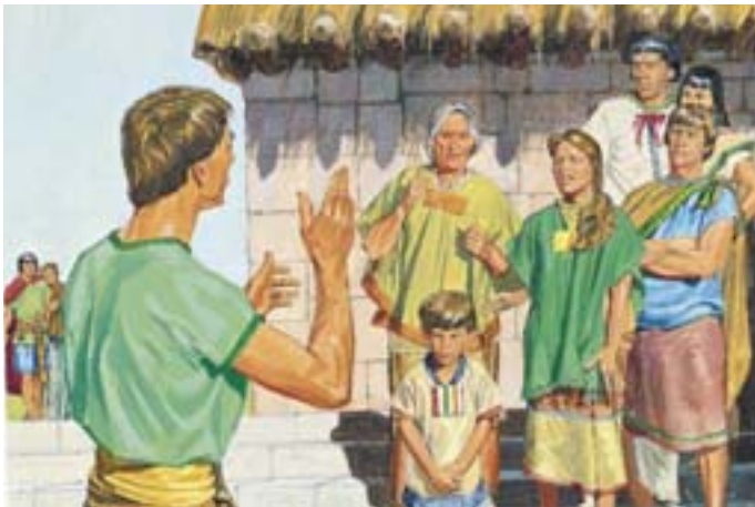
Alma told the people to repent or God would destroy them. He said Jesus Christ would come and save those who had faith in him and repented. Alma 9:12, 26-27