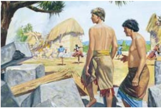
The people of Ammonihah came to see what was happening. When they saw Alma and Amulek walking out of the crumbled prison, they became scared and ran away. Alma 14:28–29