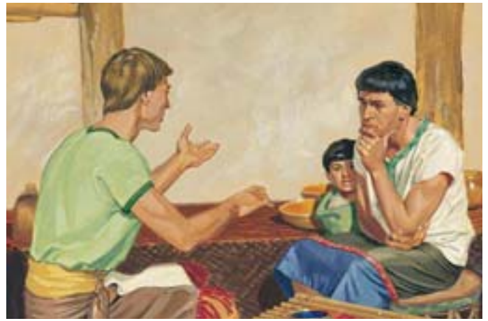
Alma told Amulek about his calling to teach the people of Ammonihah. Amulek went with Alma to teach the people. The Holy Ghost helped them. Alma 8:24-25, 30