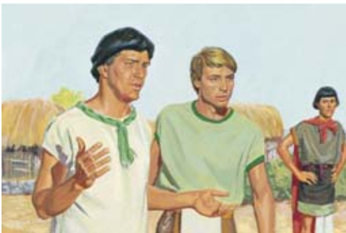
Then Amulek began to teach. Many of the people knew Amulek; he was not a stranger as Alma was. He told them about the angel he had seen. Alma 9:34; 10:4, 7