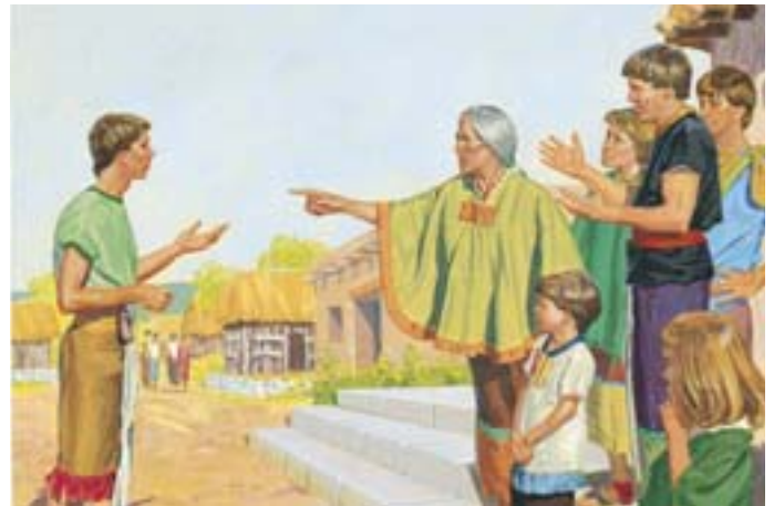
The people of Ammonihah became angry. They tried to throw Alma into prison, but the Lord protected him. Alma 9:31-33