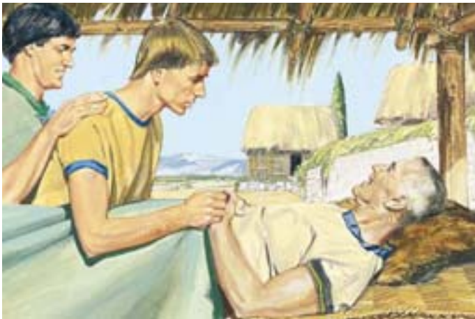
Zeezrom was glad to see Alma and Amulek. He worried that they had been killed because of what he had done. He asked them to heal him. Alma 15:4–5