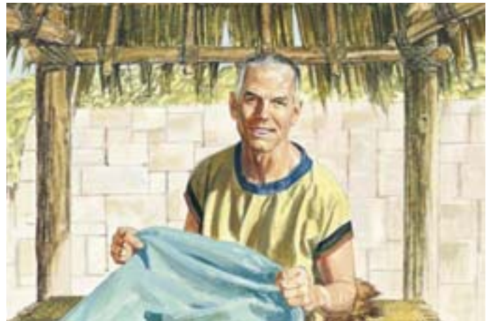
Zeezrom believed in Jesus Christ and had repented of his sins. When Alma prayed for him, Zeezrom was immediately healed. Alma 15:10–11