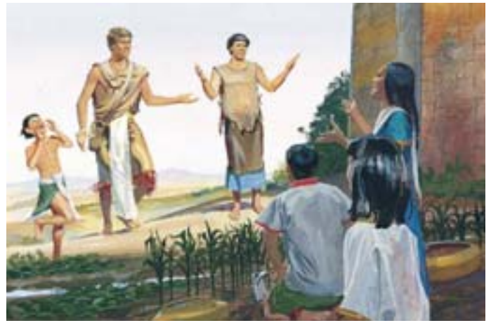
The Lord told Alma and Amulek to go to Sidom. There they found the righteous people. Zeezrom was also there and was very sick. Alma 15:1–3