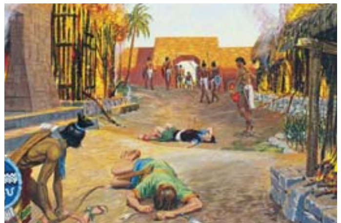
The wicked people of Ammonihah were all killed by a Lamanite army, as Alma had prophesied. Alma 10:23; 16:2, 9