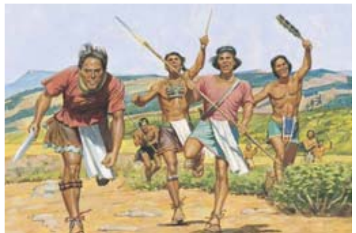
The Lamanite robbers were not afraid of Ammon. They thought they could easily kill him. Alma 17:35