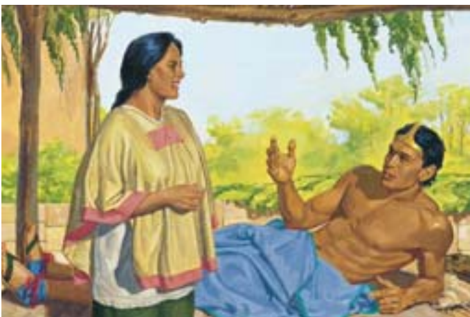
She stayed by Lamoni's side all night. The next day Lamoni got up and said he had seen Jesus Christ. The king and queen were filled with the Holy Ghost. Alma 19:11–13