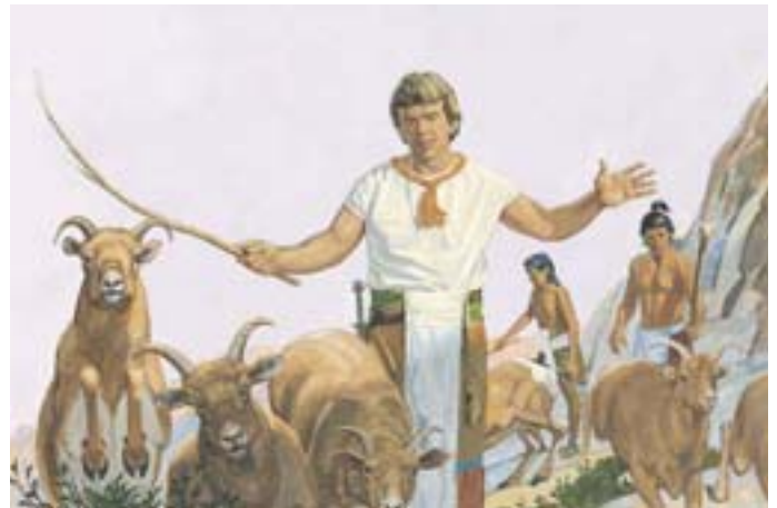
Ammon and the other servants quickly found the animals and drove them back to the watering place. Alma 17:32