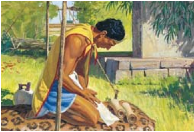
King Lamoni believed Ammon and prayed to be forgiven of his sins. Then he fell to the ground and appeared to be dead. Alma 18:40–42