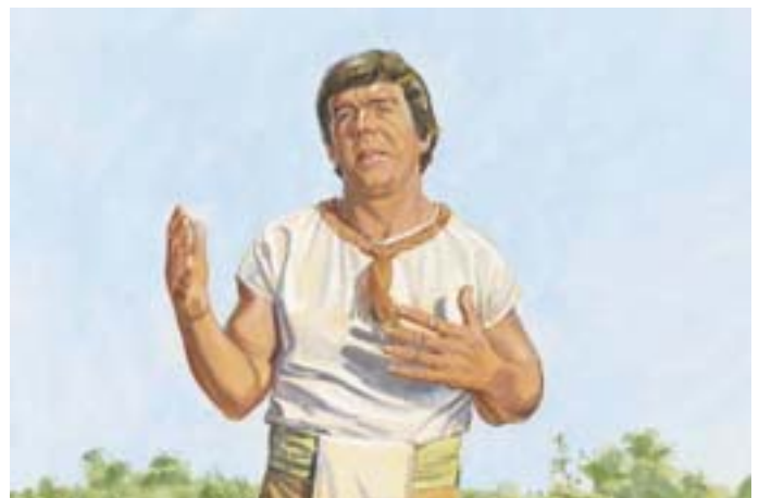
The Holy Ghost helped Ammon know what the king was thinking. Ammon explained that he was not the Great Spirit. He was a man. Alma 18:16–19