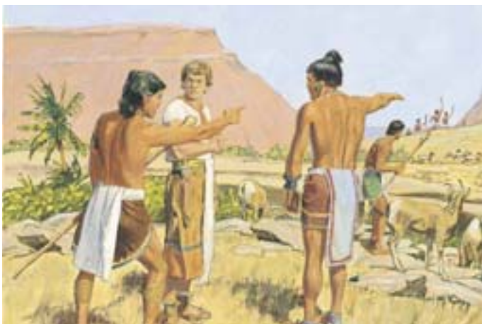
The Lamanite robbers came back. Ammon told the other servants to guard the flocks while he fought the robbers. Alma 17:33