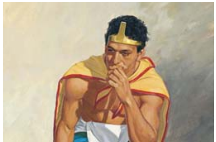
The king was astonished at Ammon's great power. He wanted to see Ammon but was afraid to because he thought Ammon was the Great Spirit. Alma 18:2–4, 11