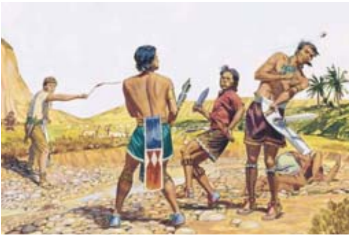
The power of God was with Ammon. He hit and killed some of the robbers with stones, which made the rest of the robbers very angry. Alma 17:35–36