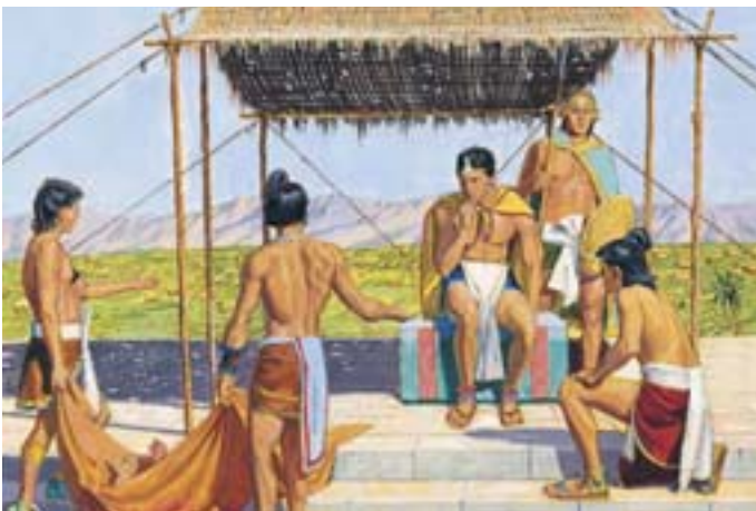
The servants took the cut-off arms to King Lamoni and told him what Ammon had done. Alma 17:39; 18:1