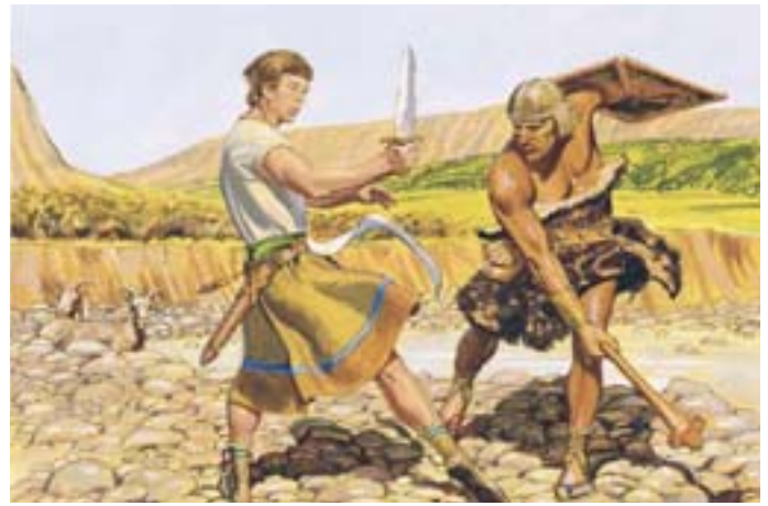
They tried to kill Ammon with their clubs, but each time a robber lifted a club to hit Ammon, he cut off the robber's arm. Frightened, the robbers ran away. Alma 17:36–38