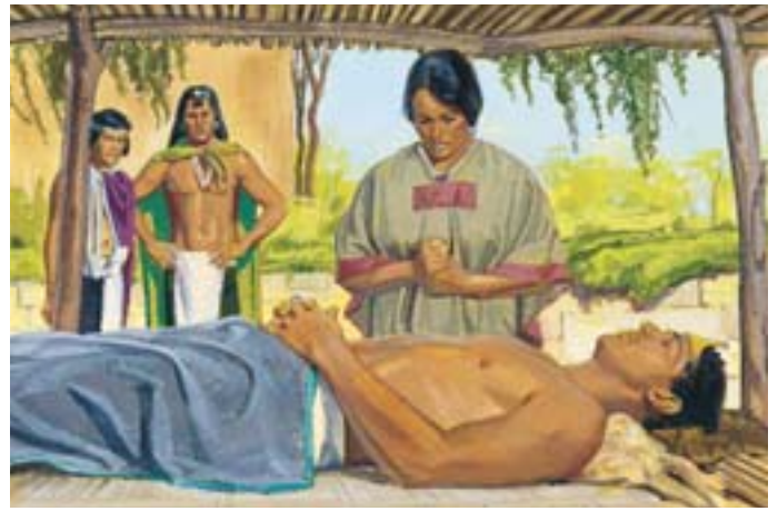
Servants carried the king to his wife and laid him on a bed. After two days the servants thought he was dead and decided to bury him. Alma 18:43; 19:1