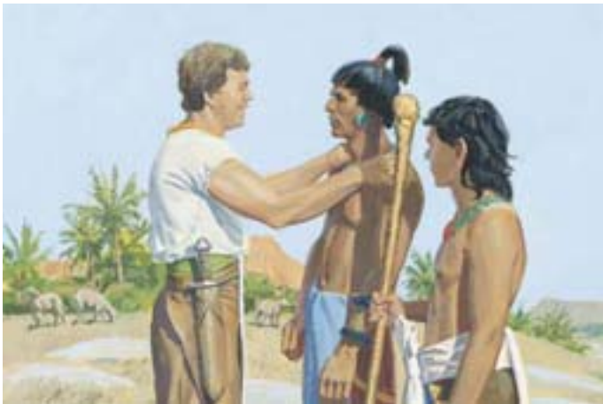
Ammon told the servants that if they gathered the scattered animals, the king would not kill them. Alma 17:31