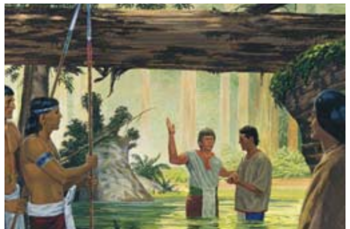
Lamoni taught his people about God and Jesus Christ. Those who believed repented of their sins and were baptized. Alma 19:31, 35