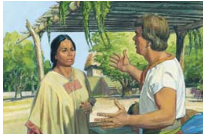
Ammon knew Lamoni was under the power of God. He told the queen that Lamoni would awaken the next day. Alma 19:6–8