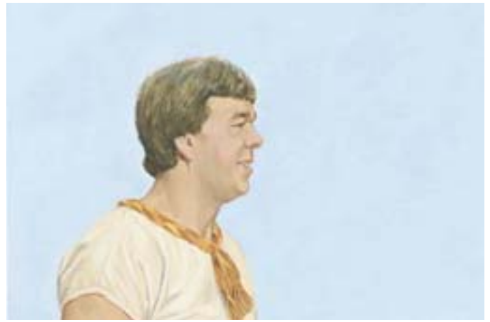
Ammon knew this was his chance to use the Lord's power to win the hearts of the Lamanites. Then they would listen to his teachings. Alma 17:29