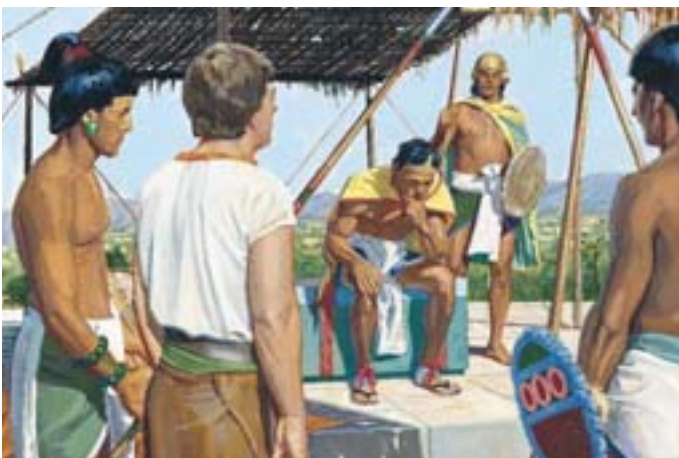
When Ammon did go in to see him, King Lamoni did not know what to say. He did not speak for an hour. Alma 18:14