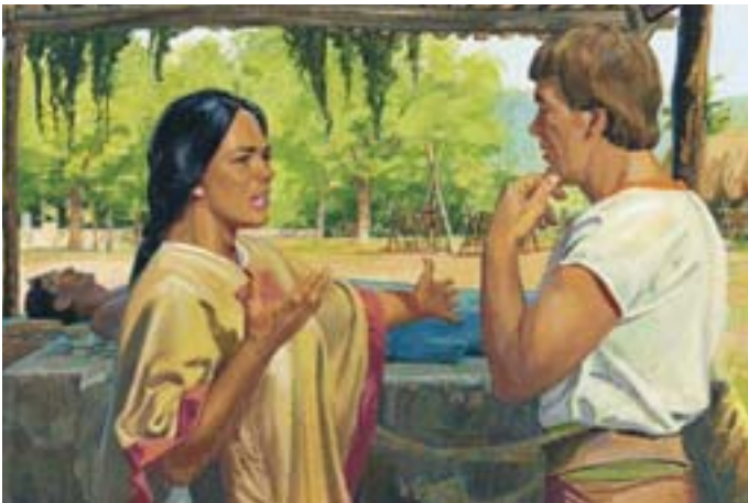
The queen did not believe that her husband was dead. Having heard of Ammon's great power, she asked him to help the king. Alma 19:2–5