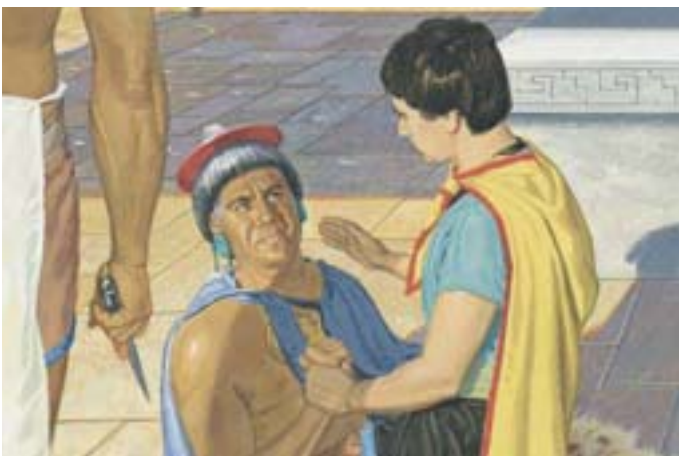
Before a large crowd could gather and cause trouble, Aaron took the king's hand and told him to stand. The king stood. Alma 22:22