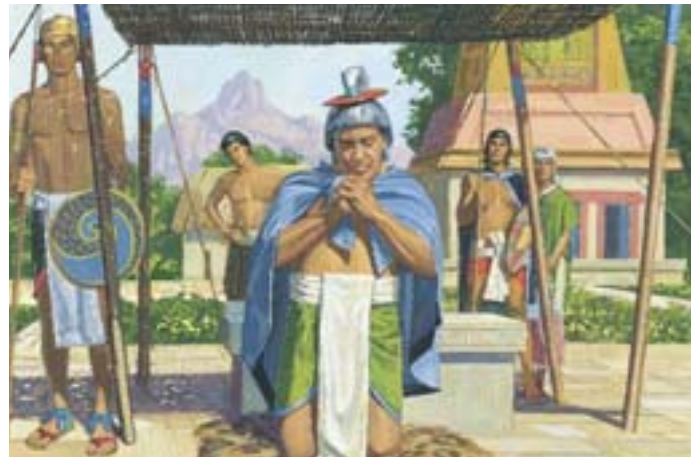
The king prayed to know if there really is a God. He said he would give up all his sins. Alma 22:17-18