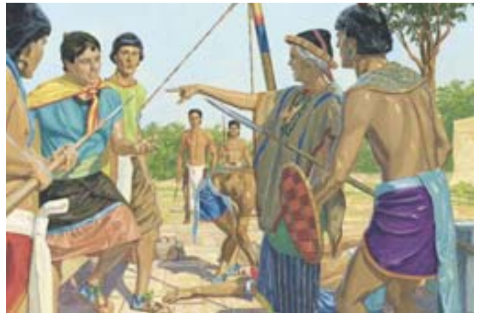
The queen ordered her servants to kill Aaron and his companions, but the servants were afraid to. She sent them to find other people who would do it. Alma 22:20-21