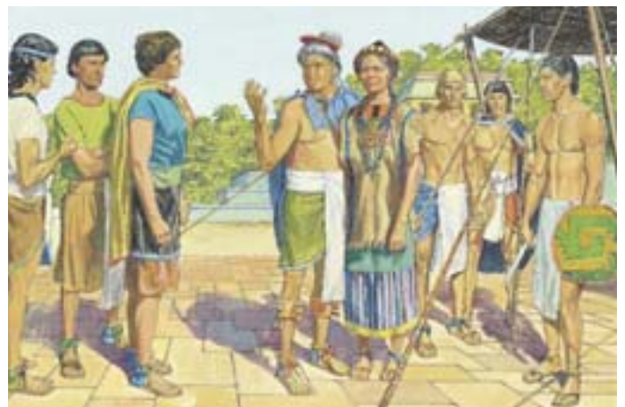
The king calmed his frightened wife and servants and then taught them the gospel. They all believed in Jesus Christ. Alma 22:23