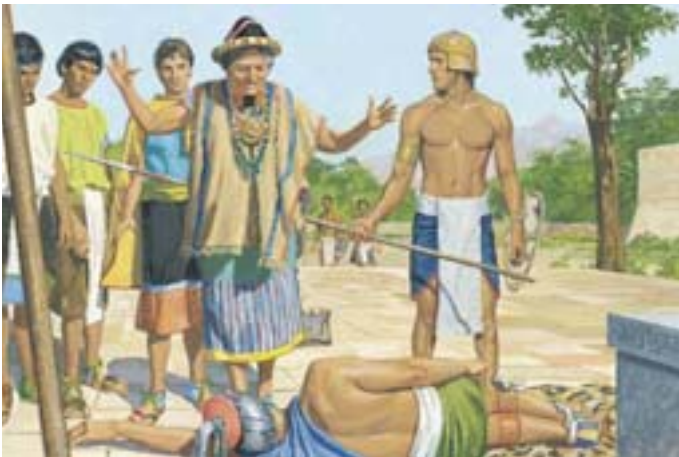
The king fell to the ground and appeared to be dead. When the queen saw him, she thought Aaron and his companions had killed him. Alma 22:19