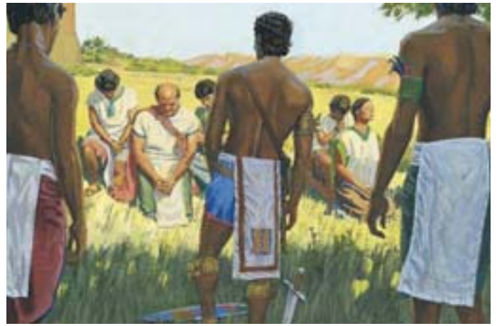
Seeing that the people of Ammon would not fight back, many of the wicked Lamanites stopped killing them. Alma 24:23–24