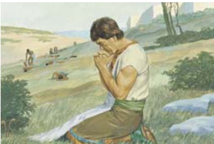
Not wanting the people he loved to be destroyed, Ammon prayed for help. The Lord told him to take his people and leave the land. Alma 27:4–5, 10–12