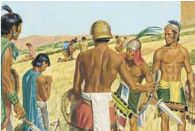
The Lamanites were sorry that they had killed. They threw down their weapons and joined the people of Ammon. They would not fight anymore. Alma 24:24–27