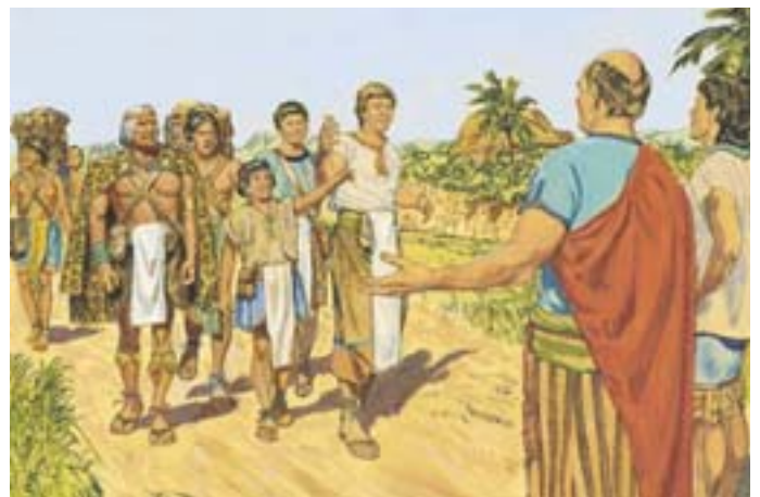
The Nephites in Zarahemla gave Ammon and his people the land of Jershon and protected them. They became friends. Alma 27:22–23