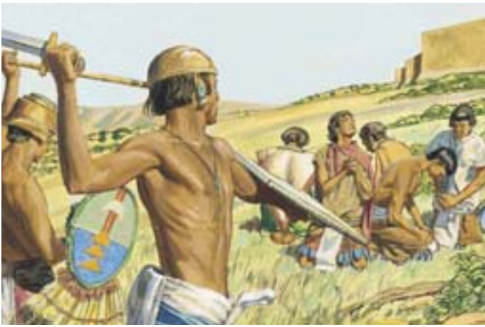
When the wicked Lamanites came and began killing them, they bowed to the ground and prayed. Alma 24:21