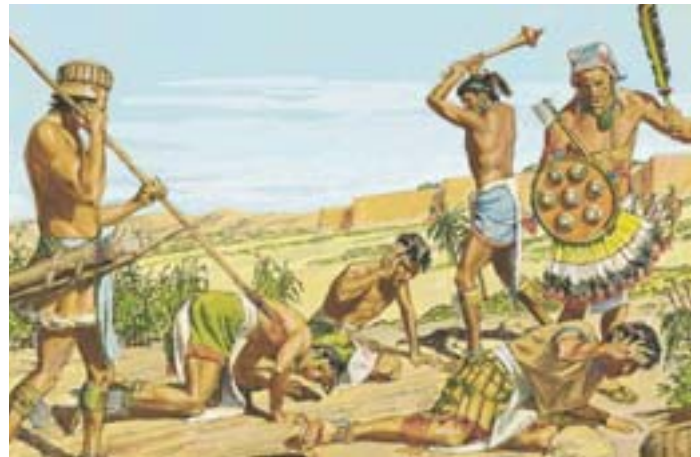
More Lamanites came to kill the people of Ammon. They still would not fight back, and many were killed. Alma 27:2–3