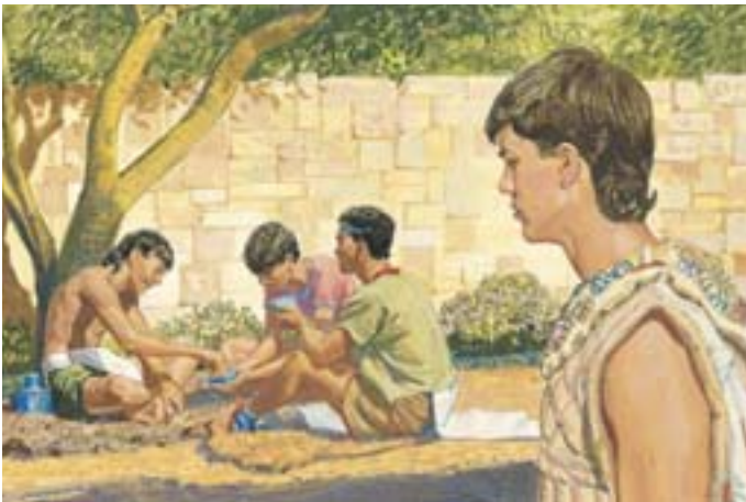
Captain Moroni was angry with the king-men for not fighting. He had worked hard to keep the Nephites free. Alma 51:14