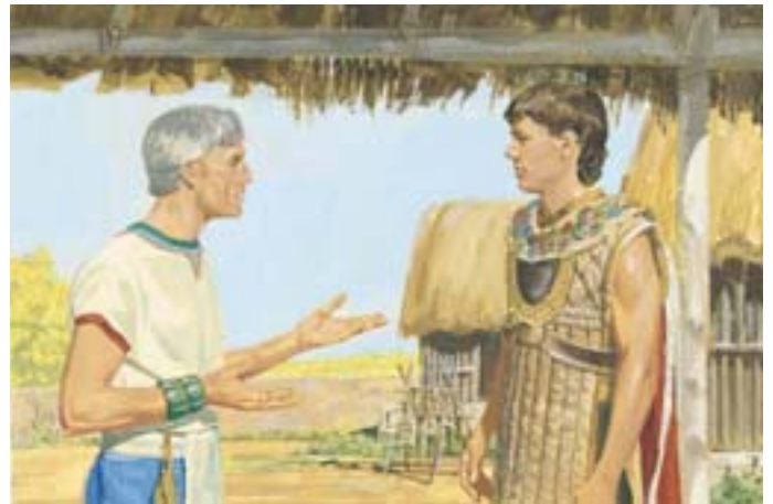
He asked the governor for the power to make the king-men either fight the Lamanites or be put to death. Alma 51:15