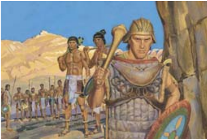
At the same time, Amalickiah was gathering a large army of Lamanites to attack the Nephites. Alma 51:9