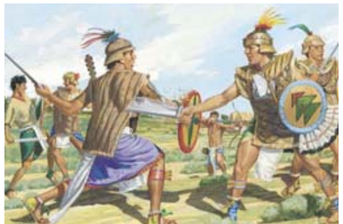
Many king-men were killed; some were put into prison. The rest agreed to help defend their country against the Lamanites. Alma 51:19-20