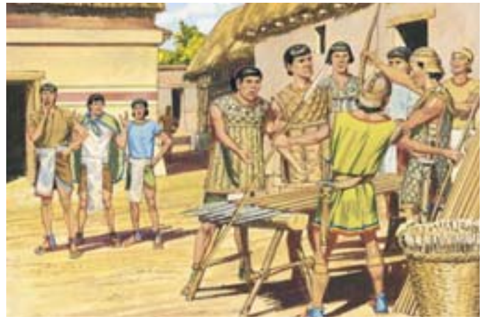
When the king-men heard that the Lamanites were coming, they were pleased and refused to help defend their country. Alma 51:13