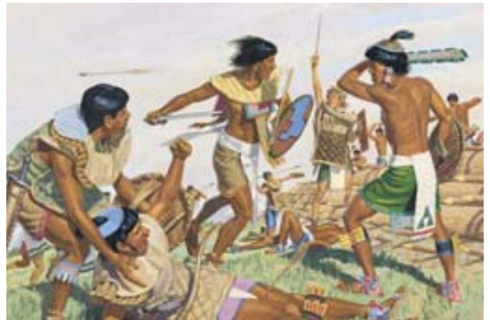
Helaman and his army fought several battles against the Lamanites. These young men obeyed all of Helaman's orders. Alma 57:19-21