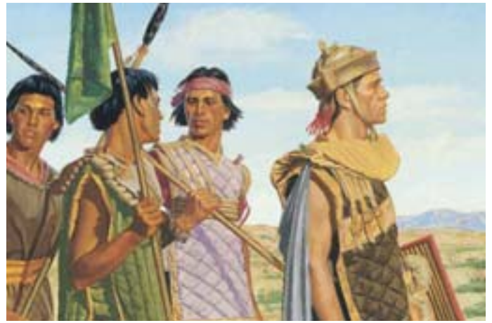
Helaman led his 2,000 young warriors into battle. He called them his sons, and they called him their father. Alma 53:22; 56:46