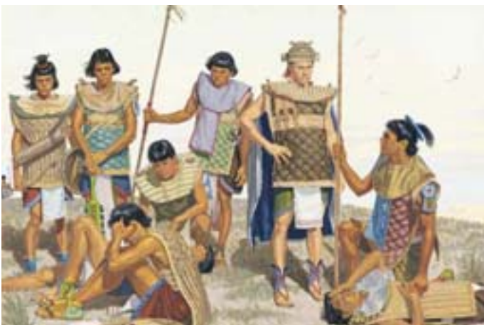
They fought bravely and helped drive the enemy away. After the battle Helaman found that all his sons had been hurt but not one had been killed. Alma 57:22, 25