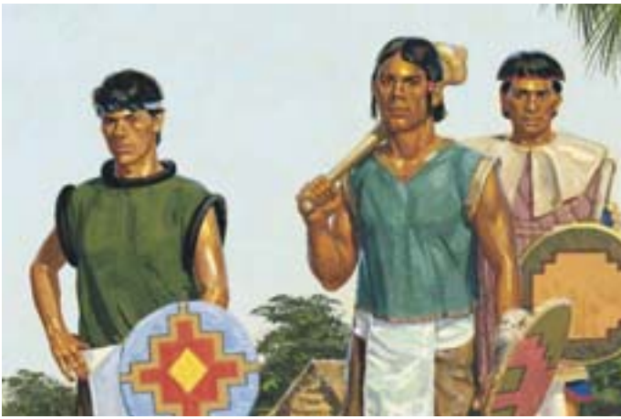
These young men were valiant, brave, and strong. They were also honest and trustworthy, and they kept the commandments of God. Alma 53:20-21