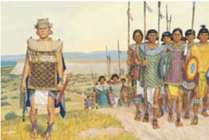
Although the sons of Helaman had never fought, they were not afraid. Their mothers had taught them to have faith in God and to know that he would help them. Alma 56:47