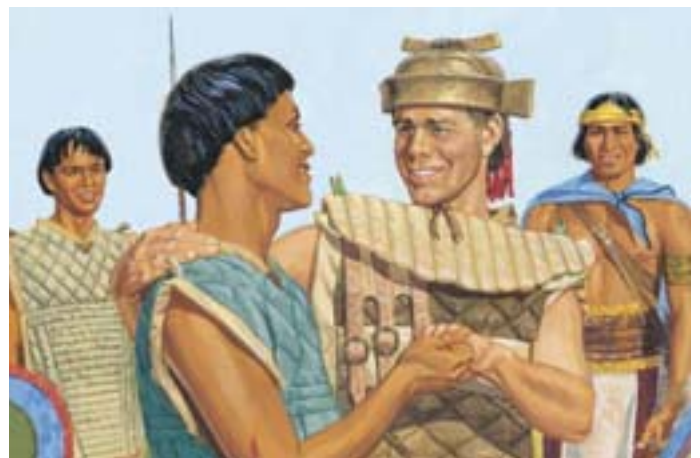
It was a miracle. Helaman was very happy. He knew that these young men had been protected because of their great faith in God. Alma 57:26-27