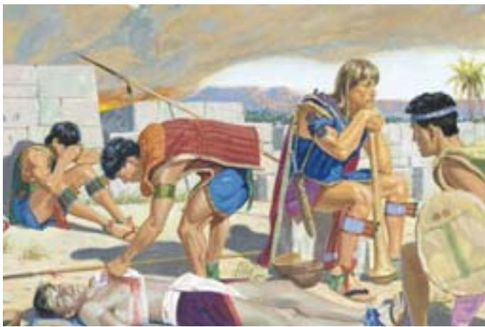
Captain Moroni wrote that many people had been killed because Pahoran had not sent more soldiers. Alma 60:5