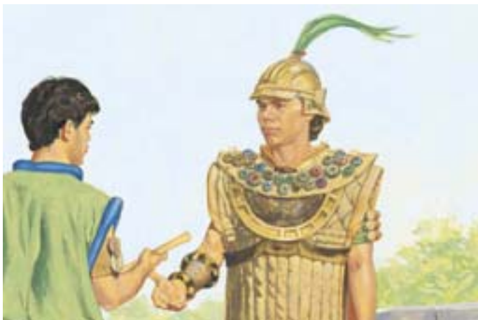
Soon Moroni received a letter from Pahoran. He was very sad that Moroni and his armies were suffering. Alma 61:1–2