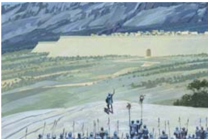
Pahoran added that he was gathering an army to try to take back Zarahemla. Alma 61:6–7