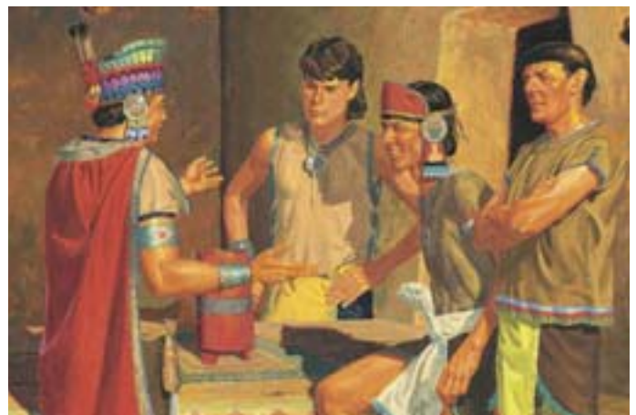
The king-men had chosen a king to be their leader and had joined the Lamanites. Alma 61:8