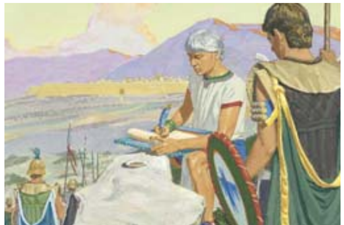
Pahoran told Moroni that a group of wicked Nephites called king-men did not want him to be chief judge. They had forced him and his supporters out of Zarahemla. Alma 61:3–5