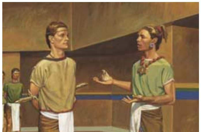
The judges offered Nephi money and his life if he would say he had plotted to kill the chief judge. Helaman 9:20-21