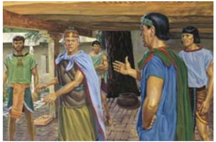
Nephi told them to ask Seantum if he and Nephi had plotted to murder Seezoram. Nephi said Seantum would say "no." Helaman 9:27-28