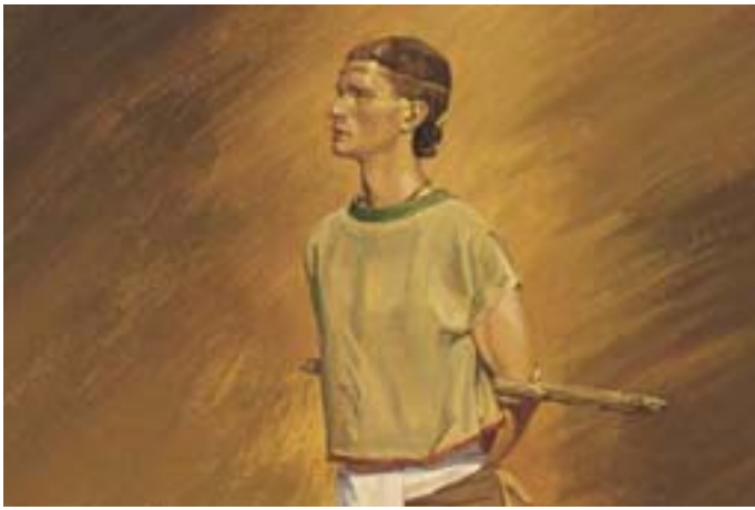
Nephi told the judges to repent of their wickedness. Then he told them to go to Seantum, Seezoram's brother. Helaman 9:22, 26