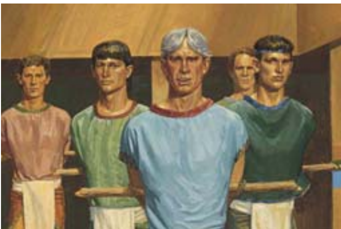
Knowing that Nephi was a prophet, the five men argued with the judges, but they would not listen. They had Nephi tied up. Helaman 9:18-19