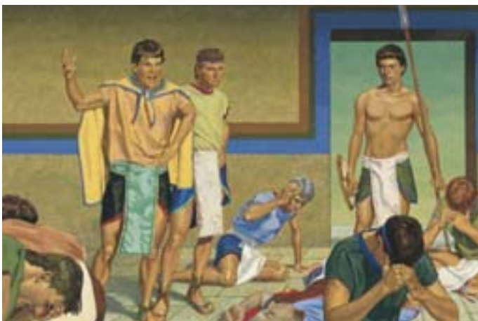
The people thought the five men had murdered Seezoram. Helaman 9:8