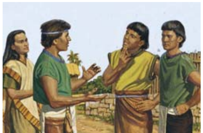
They threw the five men into prison and then sent word throughout the city that the chief judge had been killed and that the murderers were in prison. Helaman 9:9