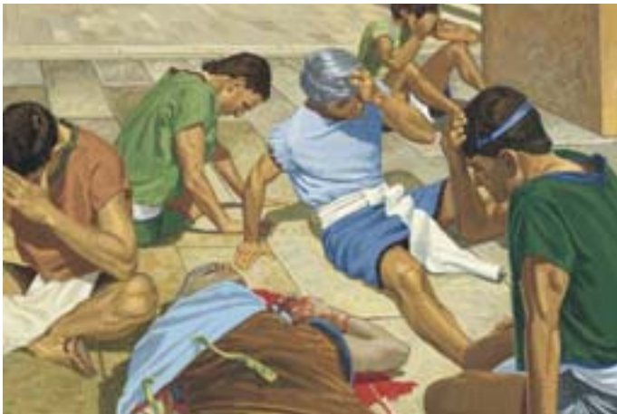
When they saw Seezoram, the chief judge, lying in his blood, they fell to the ground in fear. Now they knew that Nephi was a prophet. Helaman 9:3-5