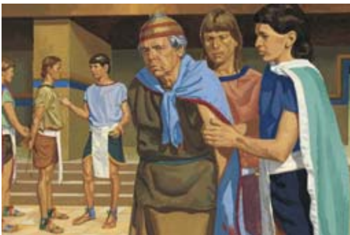
The judges went to Seantum's house, and everything happened as Nephi said it would. Nephi and the five men were set free. Helaman 9:37-38