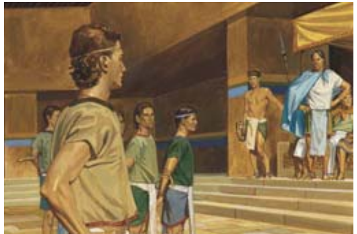
The five men said they had found the chief judge lying in blood, just as Nephi had said. Then the judges accused Nephi of sending someone to murder Seezoram. Helaman 9:15-16