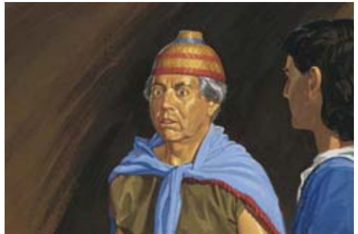
Nephi said Seantum would then shake and turn pale and finally confess to killing his brother. Helaman 9:33-35