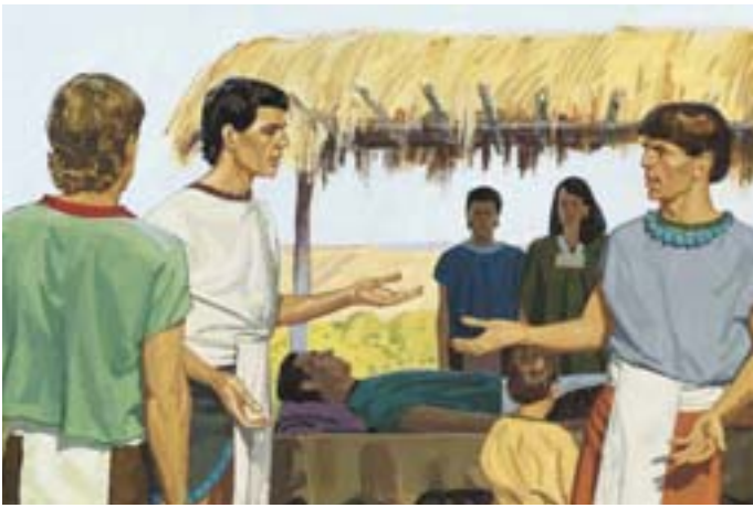
The next day the people went to where the chief judge would be buried. The judges who had been at Nephi's garden asked where the five men were. Helaman 9:10-12