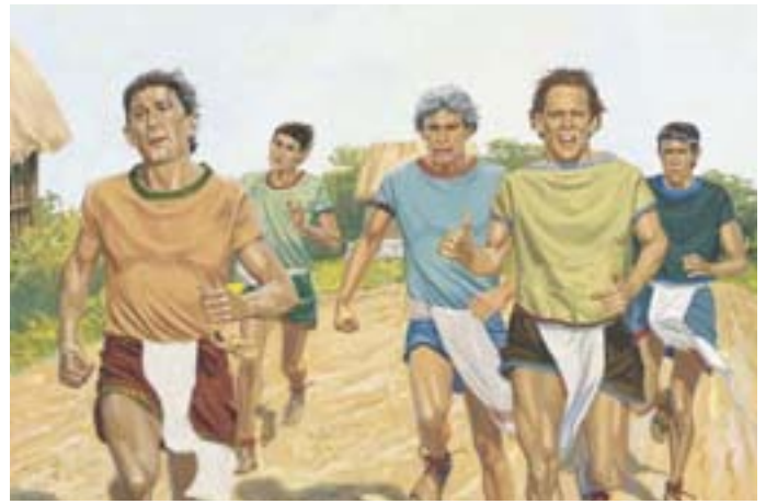
Five men from the crowd ran to see the chief judge. They did not believe that Nephi was a prophet of God. Helaman 9:1-2