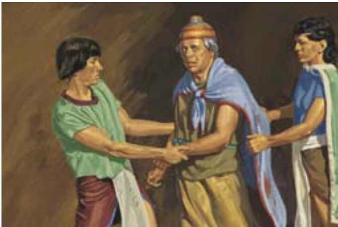
Then the judges were to ask Seantum if he had killed his brother. Seantum would again say "no," but the judges would find blood on his cloak. Helaman 9:29-31