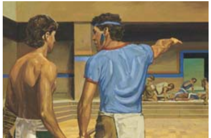
Seezoram's servants had already found the chief judge and had run to tell the people. They returned and found the five men lying there. Helaman 9:6-7