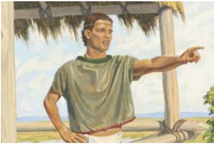
Nephi told the people to go find their chief judge. He would be lying in his own blood, murdered by a brother who wanted his position. Helaman 8:27