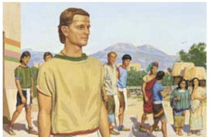
As the people walked away from Nephi, some said he was a prophet; others said he was a god. Nephi went home, still sad about their wickedness. Helaman 9:40-41; 10:2-3