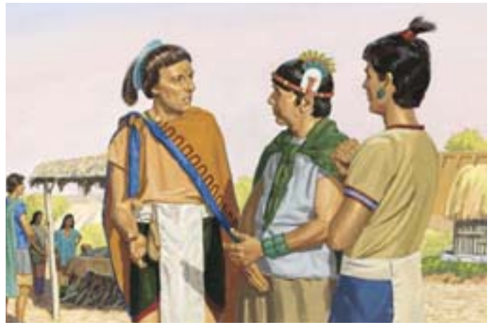
The judges asked to see the accused murderers. Helaman 9:13