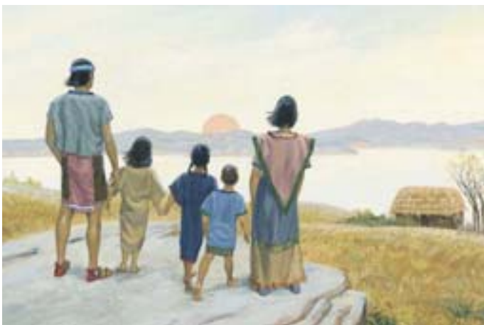
That night the sun went down, but it did not get dark. The sign of Jesus Christ's birth had come. The people were astonished. 3 Nephi 1:15