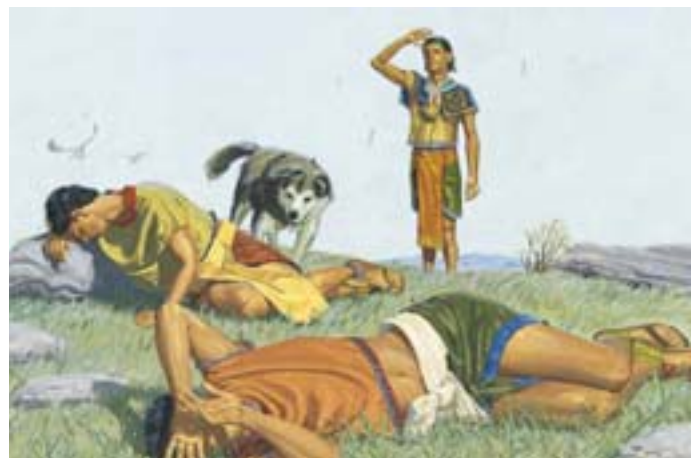
Those who had planned to kill the believers fell down and appeared to be dead. 3 Nephi 1:16