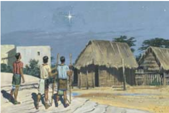
A new star appeared in the sky, just as the prophets had said it would. 3 Nephi 1:21