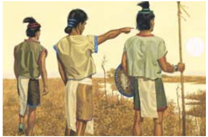
It stayed light all night. When the sun came up the next morning, the people knew that Jesus Christ would be born that day. The prophecies had been fulfilled. 3 Nephi 1:19-20