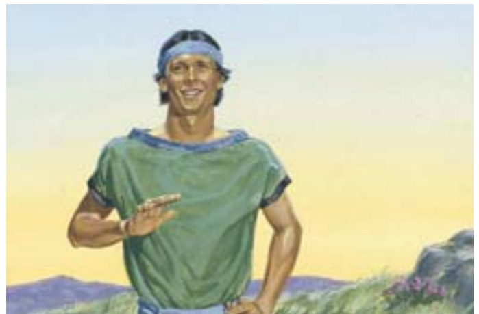
The Lord comforted Nephi and told him that it would not get dark that night. Jesus would be born the next day in Bethlehem. 3 Nephi 1:13