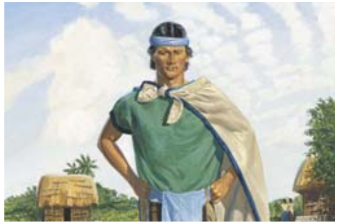
Nephi was sad because of the wickedness of those who did not believe in the Savior. 3 Nephi 1:10