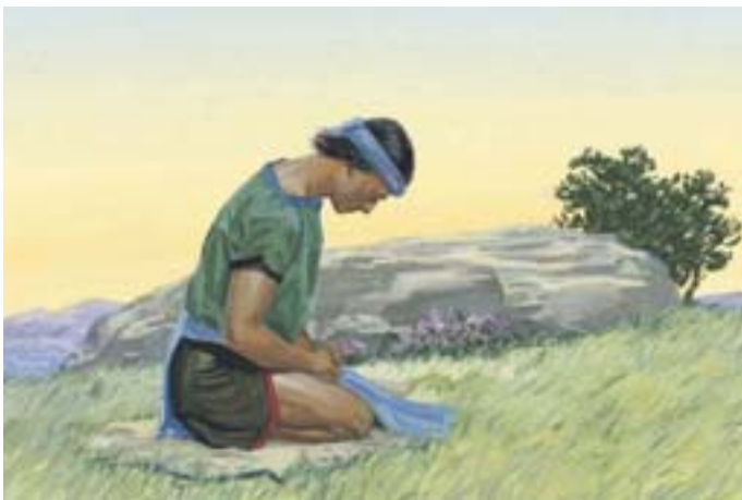
Nephi prayed all day for the people who were going to be killed. 3 Nephi 1:11-12