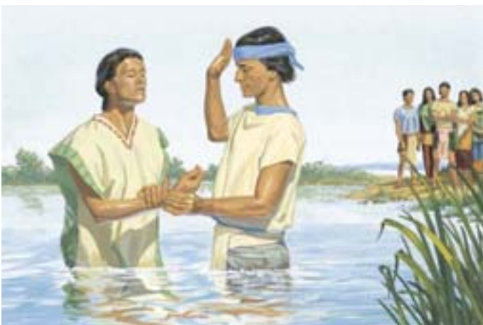
Nephi and other Church leaders baptized all those who believed and repented. 3 Nephi 1:23