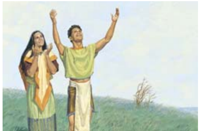
Satan still tried to get people not to believe the signs they had seen, but most did believe. 3 Nephi 1:22