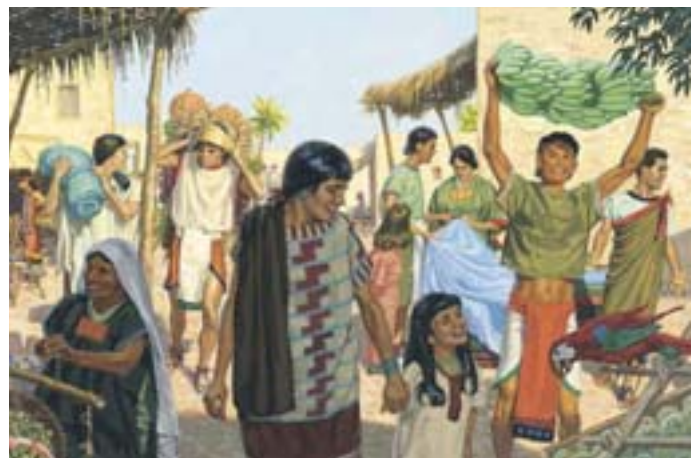
There were glad tidings in the land because the words of the prophets had been fulfilled. Jesus Christ had been born. 3 Nephi 1:26