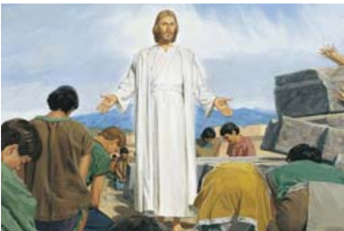
Then the people praised Jesus and fell at his feet and worshiped him. 3 Nephi 11:17