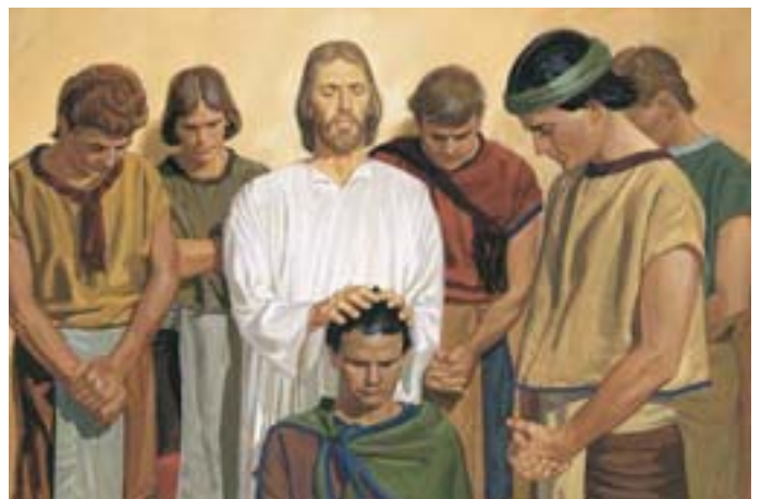
Jesus called Nephi and 11 other men to him. He gave them priesthood power and taught them the right way to baptize. 3 Nephi 11:18, 21-26; 12:1