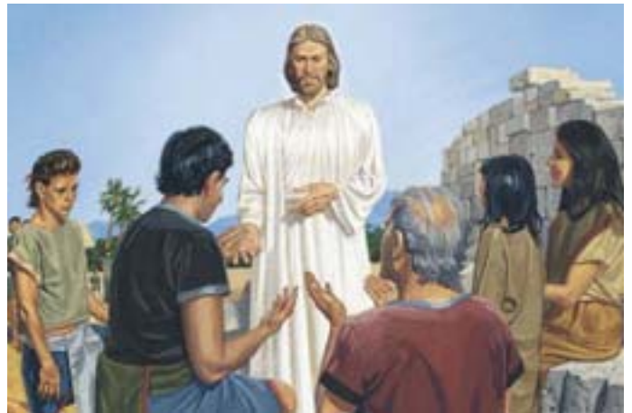
One by one the people felt the marks in Jesus' side, hands, and feet. The people knew he was the Savior. 3 Nephi 11:15