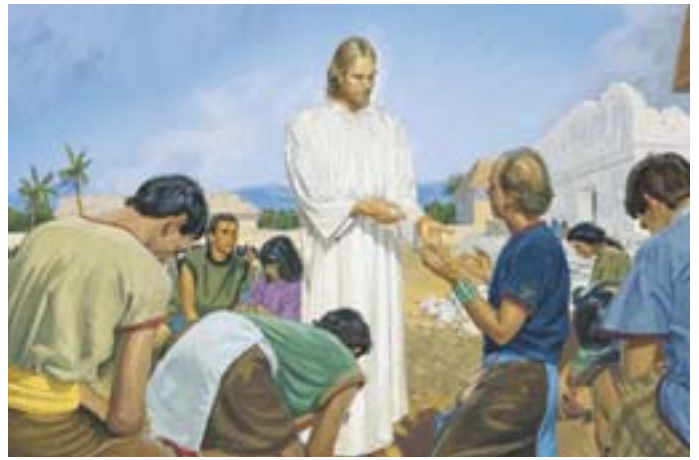
Jesus told the people to come and feel the marks in his side and in his hands and feet, where he had been nailed to the cross. 3 Nephi 11:14