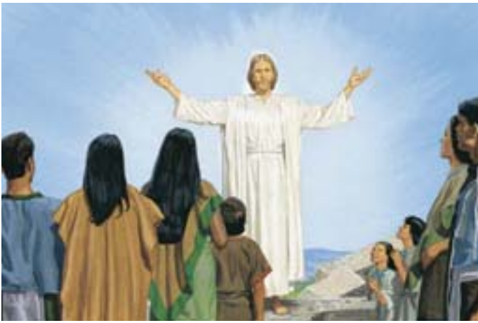
He told them he was Jesus Christ, the one the prophets had said would come. 3 Nephi 11:10