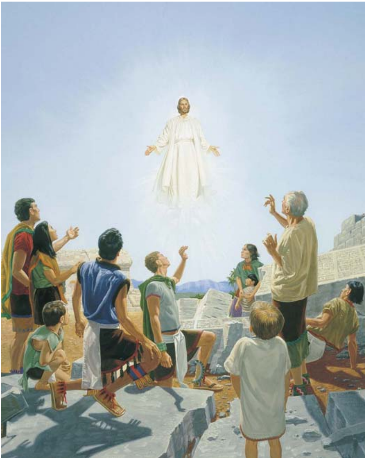
Jesus Christ came down from heaven and stood among the people. They were afraid to speak because they did not understand what was happening. They thought Jesus was an angel. 3 Nephi 11:8