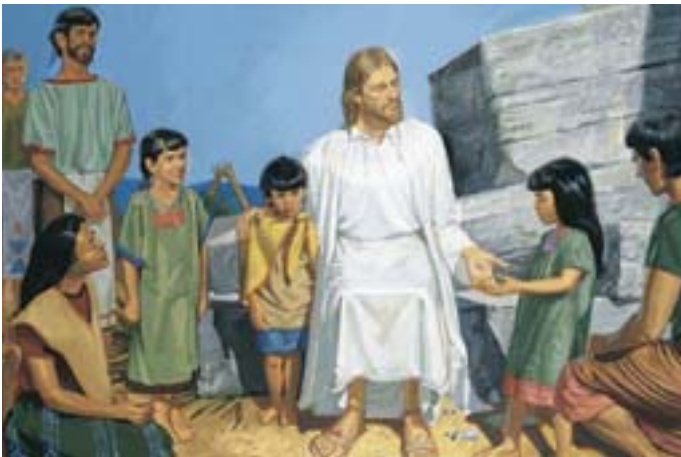
Jesus wanted the people to know that he was their God and that he had died for their sins. 3 Nephi 11:14