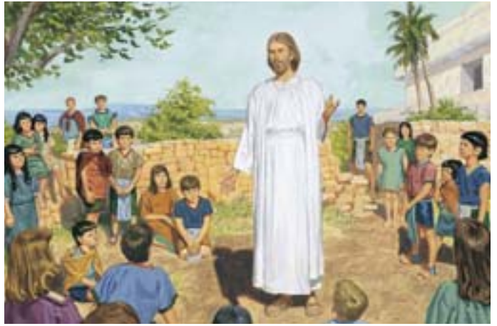
Jesus Christ told the Nephites to bring their little children to him. The children sat on the ground near Jesus. 3 Nephi 17:11–12