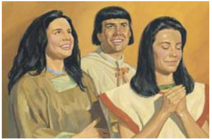
The Savior's prayer was so marvelous that it could not be written. It filled the Nephites with joy. 3 Nephi 17:15–17