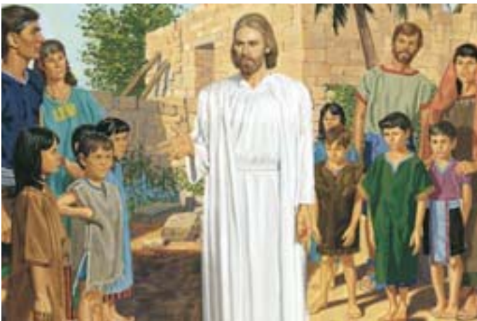
After his prayer Jesus said the Nephites would be blessed because of their faith. 3 Nephi 17:20