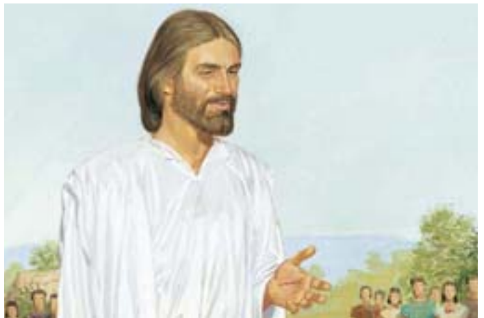
He felt so much love and happiness that he wept. 3 Nephi 17:21