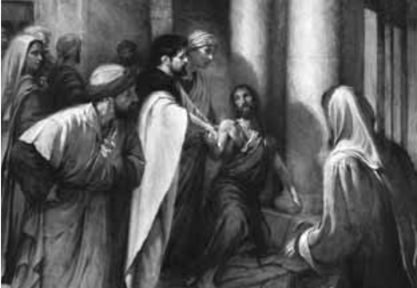
Peter and John healing a lame man (see Acts 3). Young Wilford Woodruff sought “the faith once delivered to the Saints”—a religion with the same “power before God” as the Savior’s Church in the meridian of time.

stepped into the aisle, and I said to that body of ministers: ‘My friends, will you tell me why you don’t contend for the faith once delivered to the Saints? Will you tell me why you don’t contend for that Gospel that Jesus Christ taught, and that His Apostles taught? Why do you not contend for that religion that gives unto you power before God, power to heal the sick, to make the blind to see, the lame to walk, and that gives you the Holy Ghost and those gifts and graces that have been manifest from the creation of the world? Why do you not teach the people those principles that the ancient Patriarchs and Prophets taught while they were clothed with the revelations of God? They had the administrations of angels; they had dreams and visions, and constant revelation to guide and direct them in the path in which they should walk.’