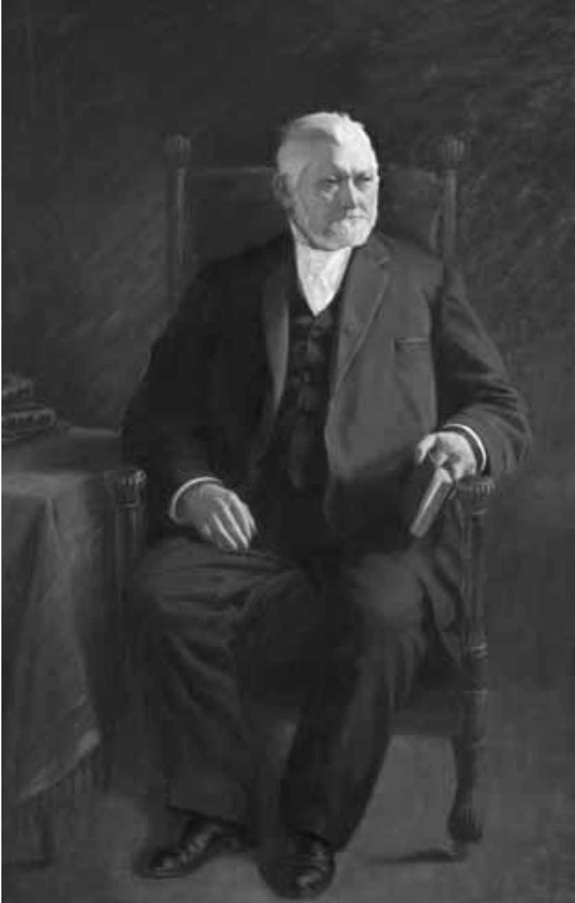
Wilford Woodruff served as President of The Church of Jesus Christ of Latter-day Saints from April 7, 1889, to September 2, 1898.