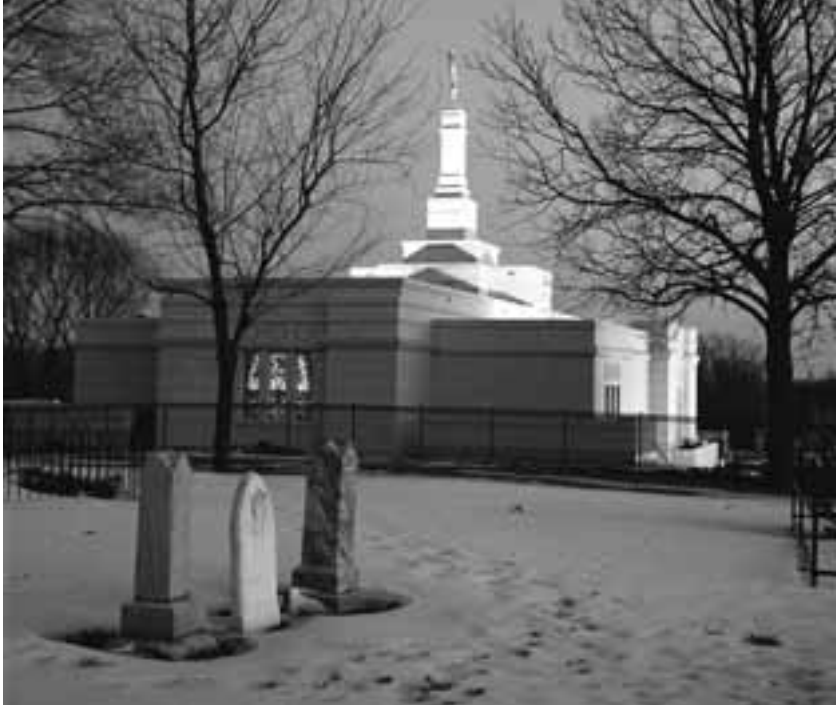
The Winter Quarters Nebraska Temple, built where many Latter-day Saints camped in the winter of 1846–47 before their trek to the Salt Lake Valley.

God is no respecter of persons; he will not give privileges to one generation and withhold them from another; and the whole human family, from father Adam down to our day, have got to have the privilege, somewhere, of hearing the gospel of Christ; and the generations that have passed and gone without hearing that gospel in its fulness, power and glory, will never be held responsible by God for not obeying it. Neither will he bring them under condemnation for rejecting a law they never saw or understood; and if they live up to the light they had they are justified so far, and they have to be preached to in the spirit world. 8