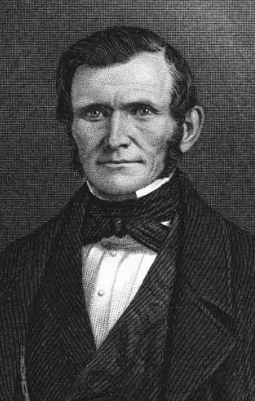
As a member of the Quorum of the Twelve Apostles, Elder Wilford Woodruff worked diligently to help establish the Church of Jesus Christ in the dispensation of the fulness of times.