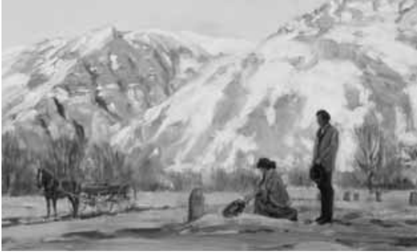
Testifying of the Savior's Atonement, President Wilford Woodruff offered comfort to parents whose little children had died.

is, they tabernacle in the flesh. They come to receive a probation and an inheritance on the earth; they obtain a body, or tabernacle, and that tabernacle will be preserved for them, and in the morning of the resurrection the spirits and bodies will be reunited, and as here we find children of various ages in a family, from the infant at the mother's breast to manhood, so will it be in the family organization in the celestial world. Our children will be restored to us as they are laid down if we, their parents, keep the faith and prove ourselves worthy to obtain eternal life; and if we do not so prove ourselves our children will still be preserved, and will inherit celestial glory. This is my view in regard to all infants who die, whether they are born to Jew or Gentile, righteous or wicked. They come from their eternal father and their eternal mother unto whom they were born in the eternal world, and they will be restored to their eternal parentage; and all parents who have received children here according to the order of God and the holy priesthood, no matter in what age they may have lived, will claim those children in the morning of the resurrection, and they will be given unto them and they will grace their family organizations in the celestial world. . . .