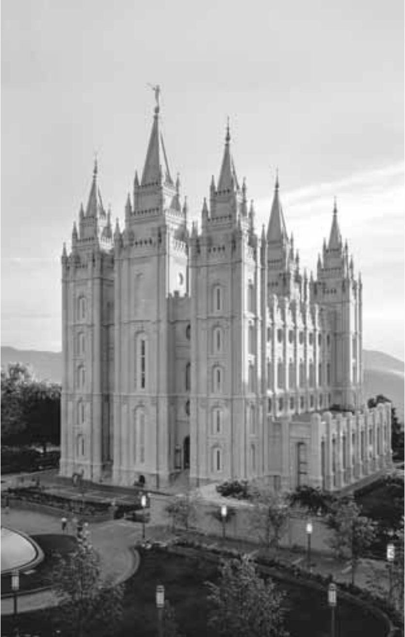
The Salt Lake Temple, dedicated by President Wilford Woodruff on April 6, 1893.