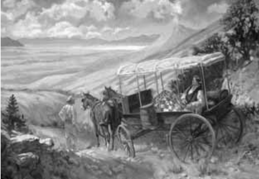
On July 24, 1847, President Brigham Young arose from his bed in Wilford Woodruff's wagon and said: "It is enough. This is the right place. Drive on."

planted them. I got them into the ground by 1 o'clock, and these, with the potatoes that the other brethren had planted, became the foundation for the future potato crops of Utah.