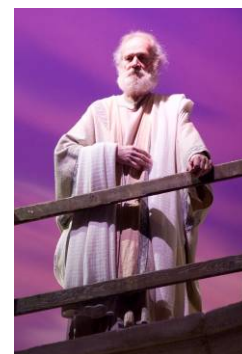
Prophet on the colonnade

In order to incorporate important messianic prophecies into the Savior of the World production, the script includes several instances in which prophets speak from the colonnade. These scriptural commentaries clarify the eternal significance of the action below and are drawn directly from the Bible and Book of Mormon. Prophetic utterances should be treated with reverence and respect. In each instance, the onstage dialogue pauses briefly, though appropriate stage business may continue, as Malachi, Abinadi, Micah, Luke, or Samuel the Lamanite speaks.