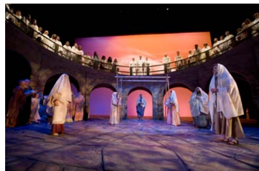
"Come, Lord Jesus—Wedding Song"

As the production Savior of the World was developed, it was important to place the earthly events surrounding Christ's birth and resurrection in the greater context of eternity. In order to suggest this connection between heaven and earth, the production team designed the colonnade with its railed walkway above the stage (for more information, see Staging and Set Design). From the colonnade—which represents heavenly space—prophets, angels, and the heavenly hosts observe mortal events taking place on the earthly sphere, the stage floor.