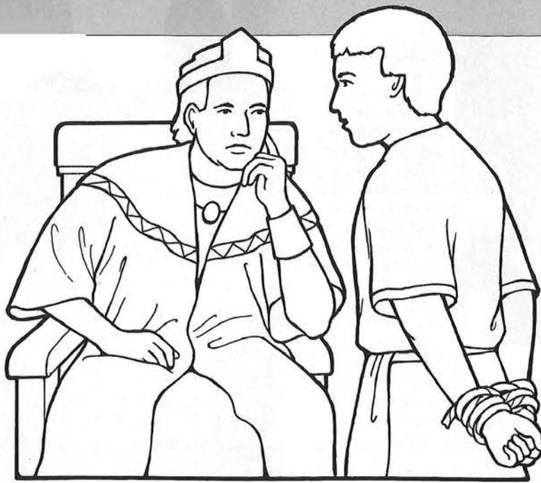
Ammon bound and standing before king