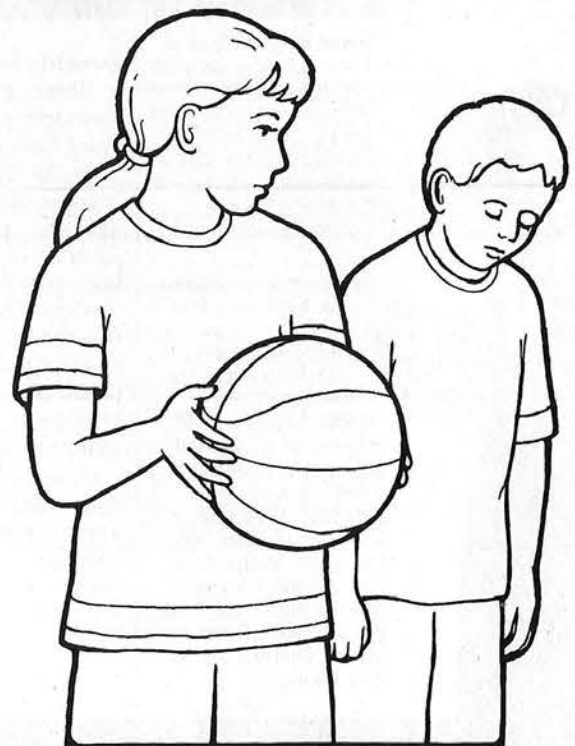
Girl noticing boy who had been teased