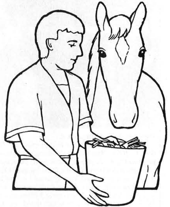
Ammon feeding a horse