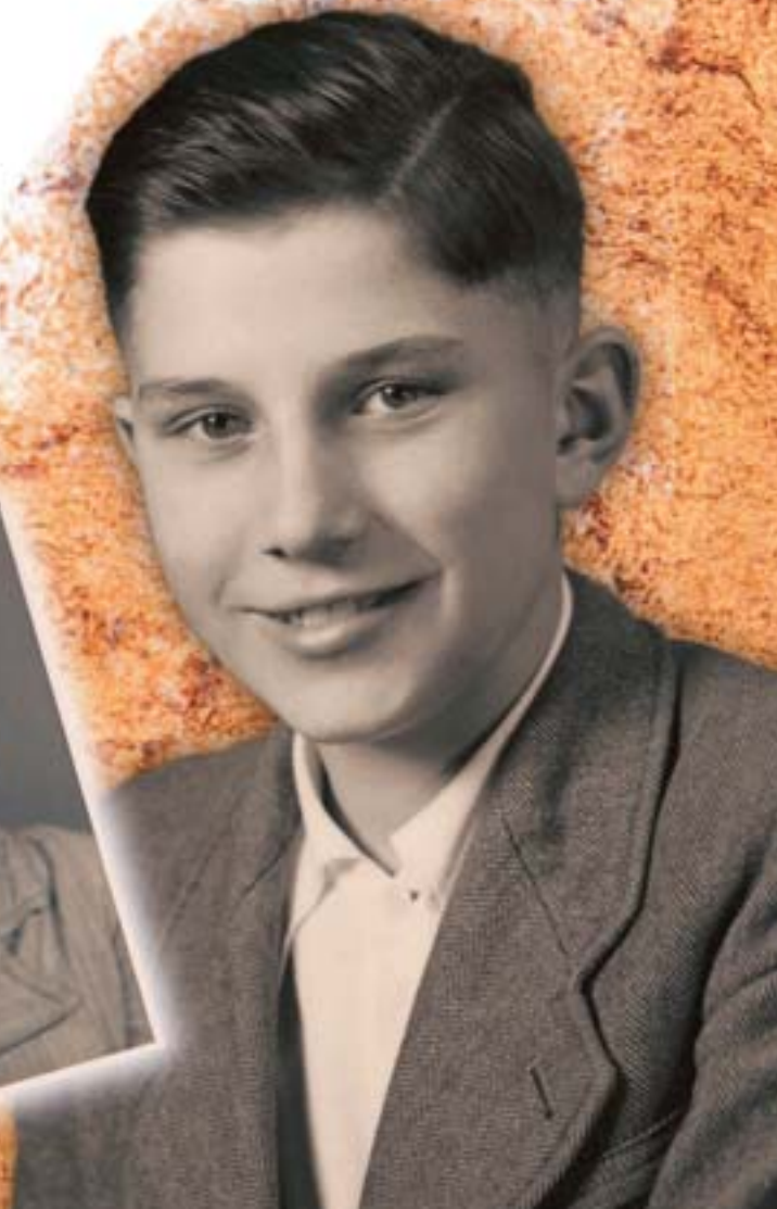
Right: At age 6. Far right: At age 14.