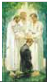
Right middle finger