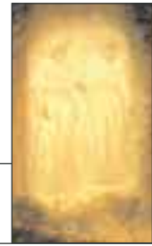
Left middle finger