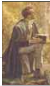
Left little finger