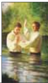
Right ring finger