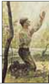
Left index finger