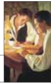
Right little finger