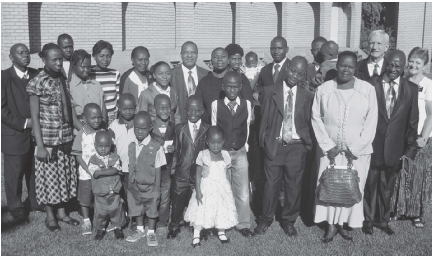
Saints from the Likasi District, DRC, attended the Johannesburg South Africa Temple.