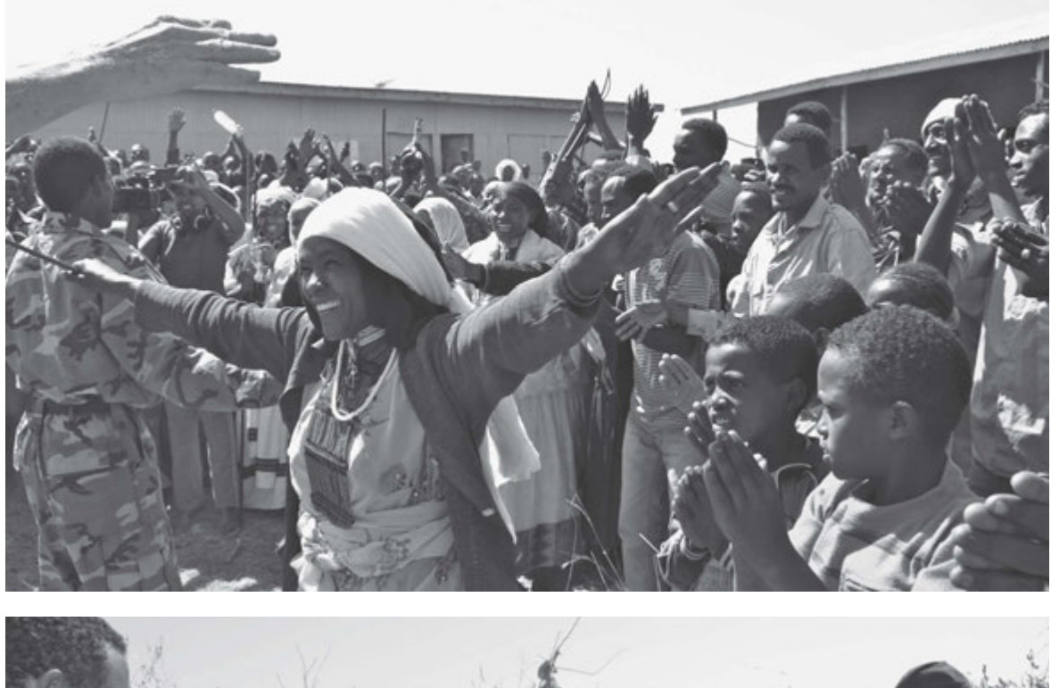
Community members rejoice over having clean water.