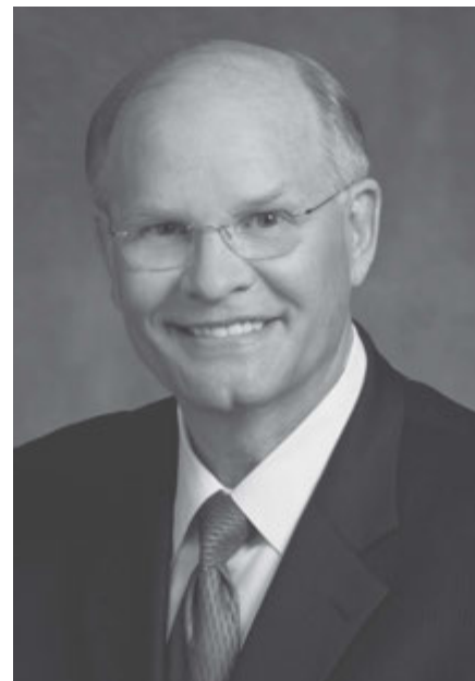
Elder Dale G. Renlund

Nephi knew that if he did the best he could, trying his utmost to live righteously, God would give him what he asked for if he did not ask amiss (see 2 Nephi 4:35). This means that aligning one's will to that of God allows God to respond to petitions. When our prayerful petitions align with God's will, we can receive what we seek. God granted that blessing to Nephi, son of Helaman, that he would receive what he asked for because God trusted