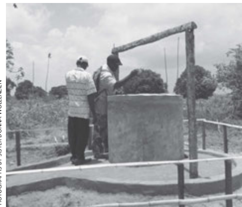
A newly finished well.