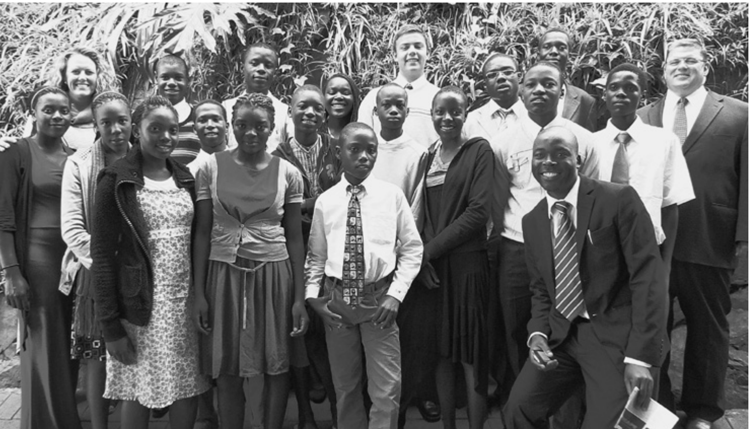
Group of youth and their leaders from Harare, Zimbabwe take trip to Johannesburg Temple