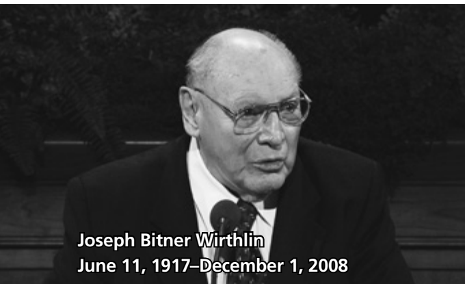
Joseph Bitner Wirthlin June 11, 1917–December 1, 2008