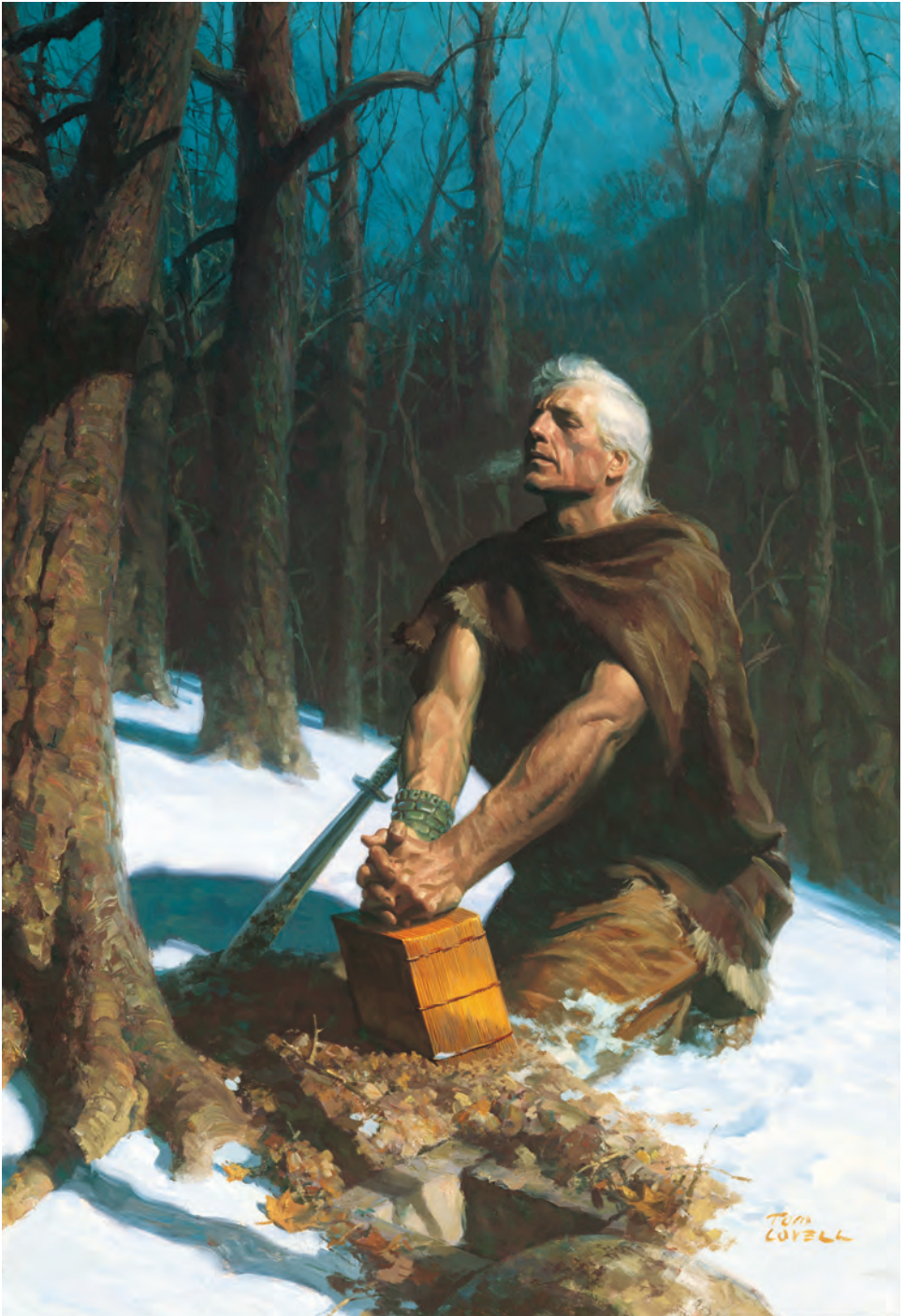
Moroni buries the Nephite record