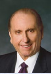
By President Thomas S. Monson