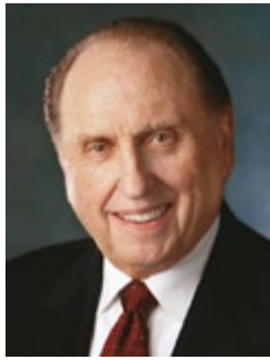
By President Thomas S. Monson

I declare my apostolic witness that the Father and the Son live. The spirit of revelation is real—and can and does function in our individual lives and in The Church of Jesus Christ of Latter-day Saints. I testify of these truths in the sacred name of the Lord Jesus Christ, amen. ■