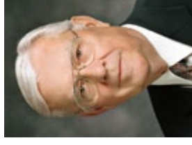
M. Russell Ballard