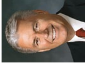
Dieter F. Uchtdorf Second Counselor