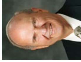
Russell M. Nelson