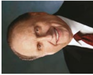
Thomas S. Monson President