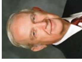
Richard G. Scott