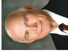
Dallin H. Oaks