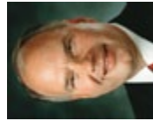
Ronald A. Rasband