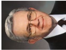
Boyd K. Packer