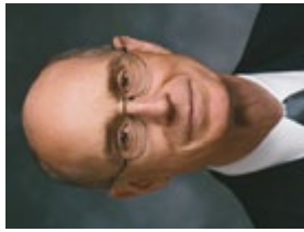
Henry B. Eyring First Counselor