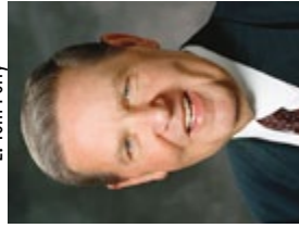
Jeffrey R. Holland