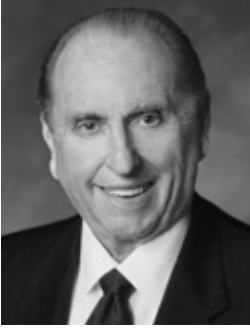
Pradhaan Thomas S. Monson Dwarra