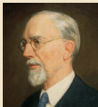
George Albert Smith 1945–51