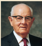
Spencer W. Kimball 1973–85