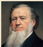
Brigham Young 1844–77