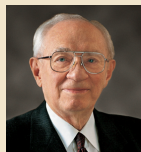
Gordon B. Hinckley 1995–2008