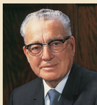
Harold B. Lee 1972–73