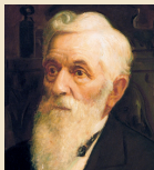
Lorenzo Snow 1898–1901