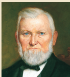
Wilford Woodruff 1887–98