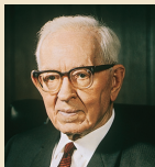
Joseph Fielding Smith 1970–72