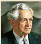
David O. McKay 1951–70