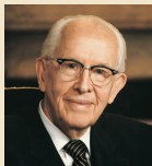
Ezra Taft Benson 1985–94