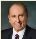
Thomas S. Monson 2008–