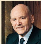
Howard W. Hunter 1994–95