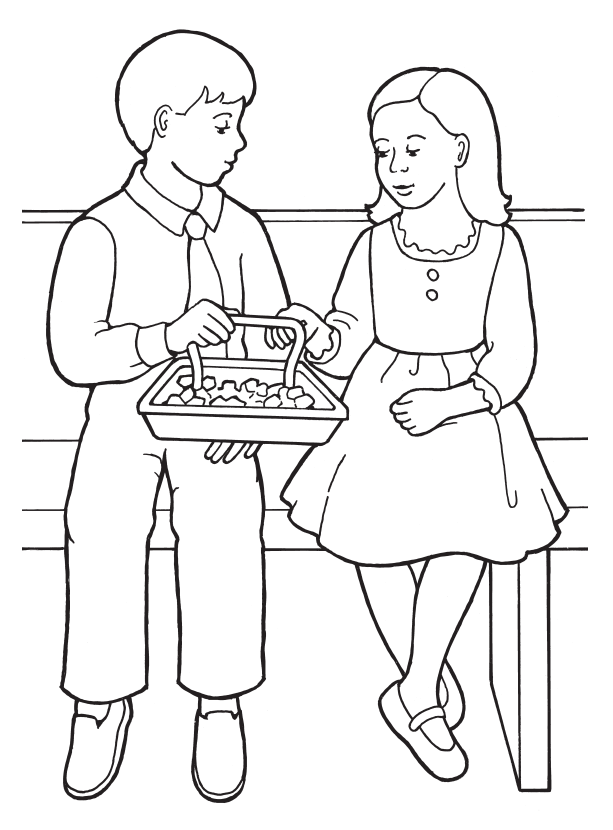
I can think of Jesus when I eat the bread.