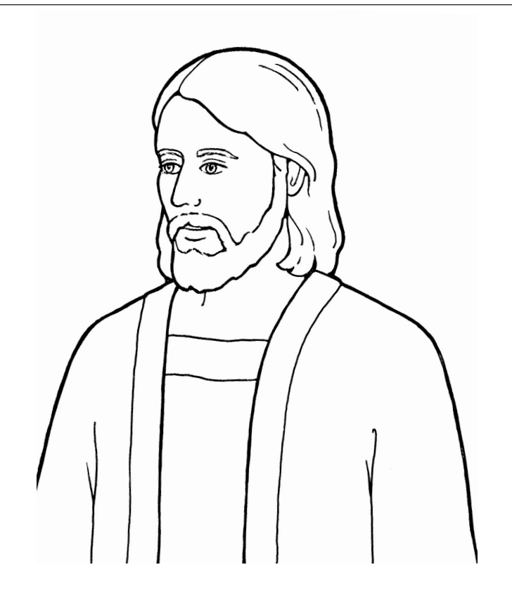
The sacrament helps me think about Jesus.