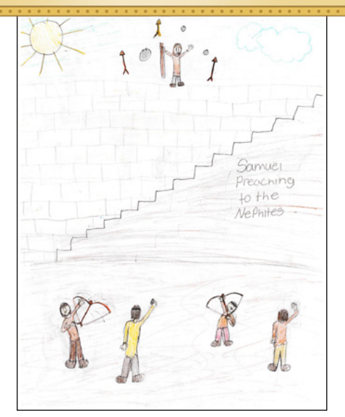
Lauren P., age 11, Utah, USA