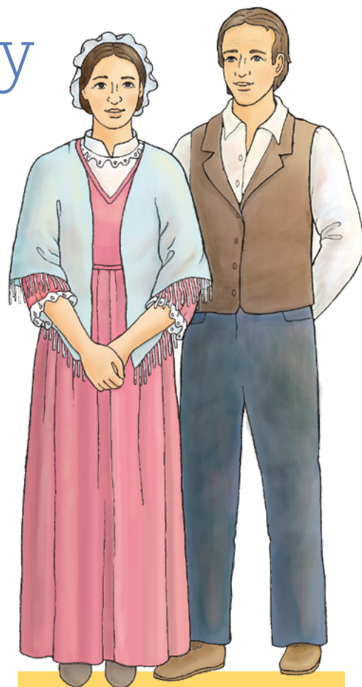
Lucy Mack Smith and Joseph Smith Sr. (Joseph's parents)