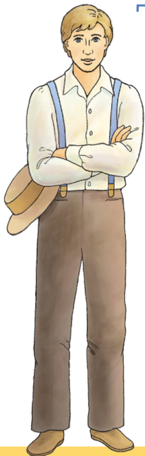
Joseph Smith Jr.

Use these to share Church history stories!