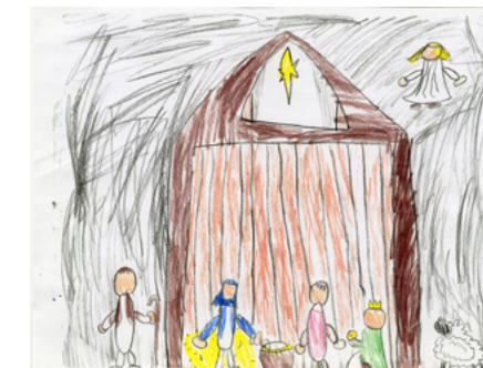
Benjamin W., age 8, Texas, USA