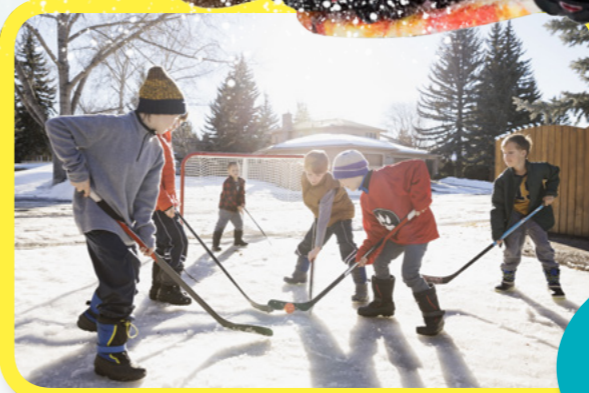
ILLUSTRATIONS BY KATIE MCDEE

Many Canadian kids like playing hockey. They skate on ice and use hockey sticks to hit a puck into the goal. You can also play it with a ball and regular shoes, like these kids (no ice required!).