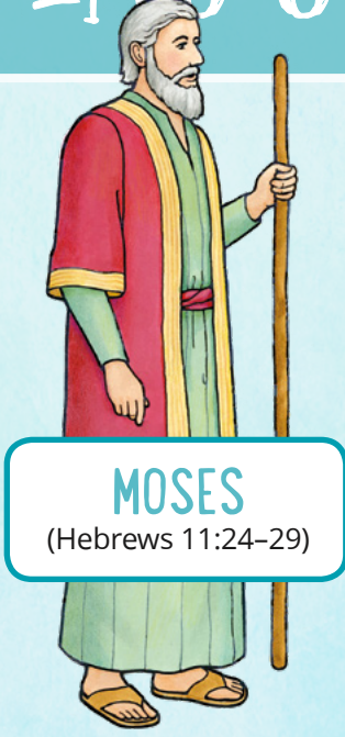
MOSES (Hebrews 11:24–29)