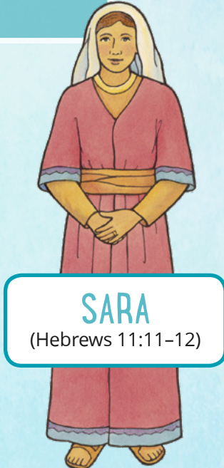
SARA (Hebrews 11:11–12)