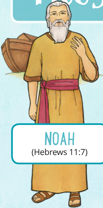
NOAH (Hebrews 11:7)

Hebrews 11 talks about faithful people who trusted God and followed Him. Match the picture of each person with their story. (Look up the scriptures if you need a hint!)