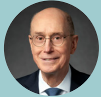
By President Henry B. Eyring Second Counselor in the First Presidency