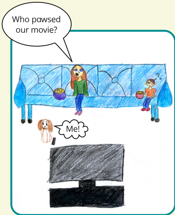
Grace H., age 13, Arizona, USA