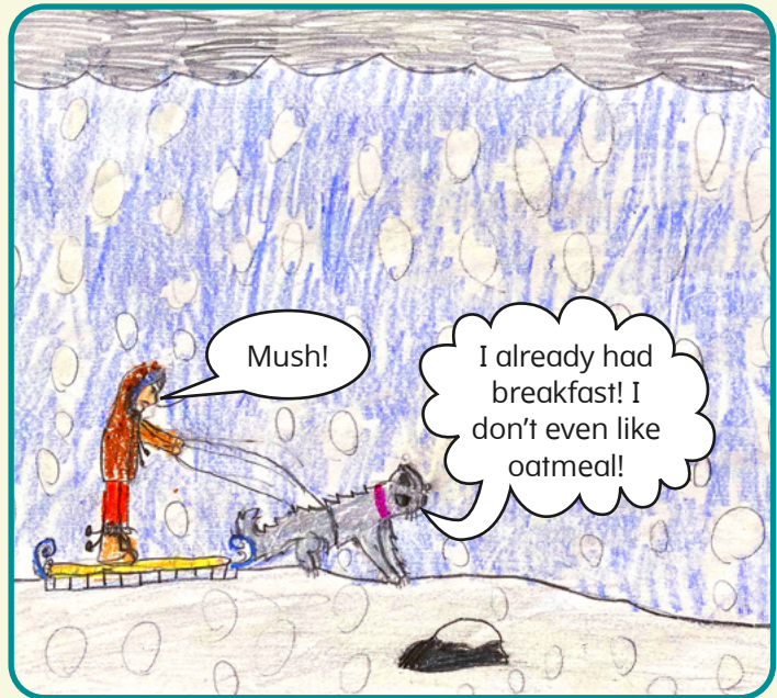
Eliza H., age 9, Suffolk, England