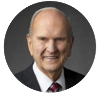
By President Russell M. Nelson